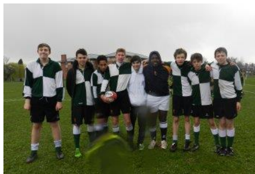
Ingram's Junior Rugby Team