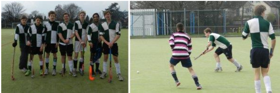
Ingram's Hockey Team

On the final day of the Lent term, Ingram's hockey team reached the semi-final of the House Hockey Tournament and the final of the Senior Rugby Tournament – both fantastic achievements. Earlier in the week, we also played in the Junior Rugby Tournament.