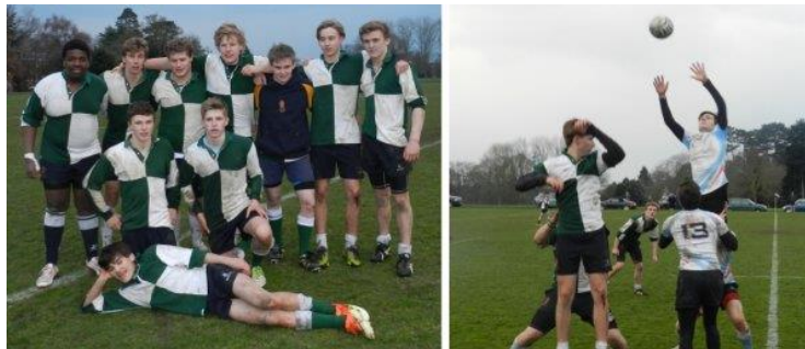
Ingram's Senior Rugby Team