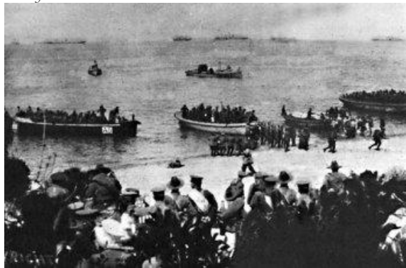
The Anzac Landings, 25th April 1915 - The Australian and New Zealand landing forces being towed ashore in ships long boats by Naval steam pinnaces

6 Victoria Crosses won before breakfast in the Dardanelles