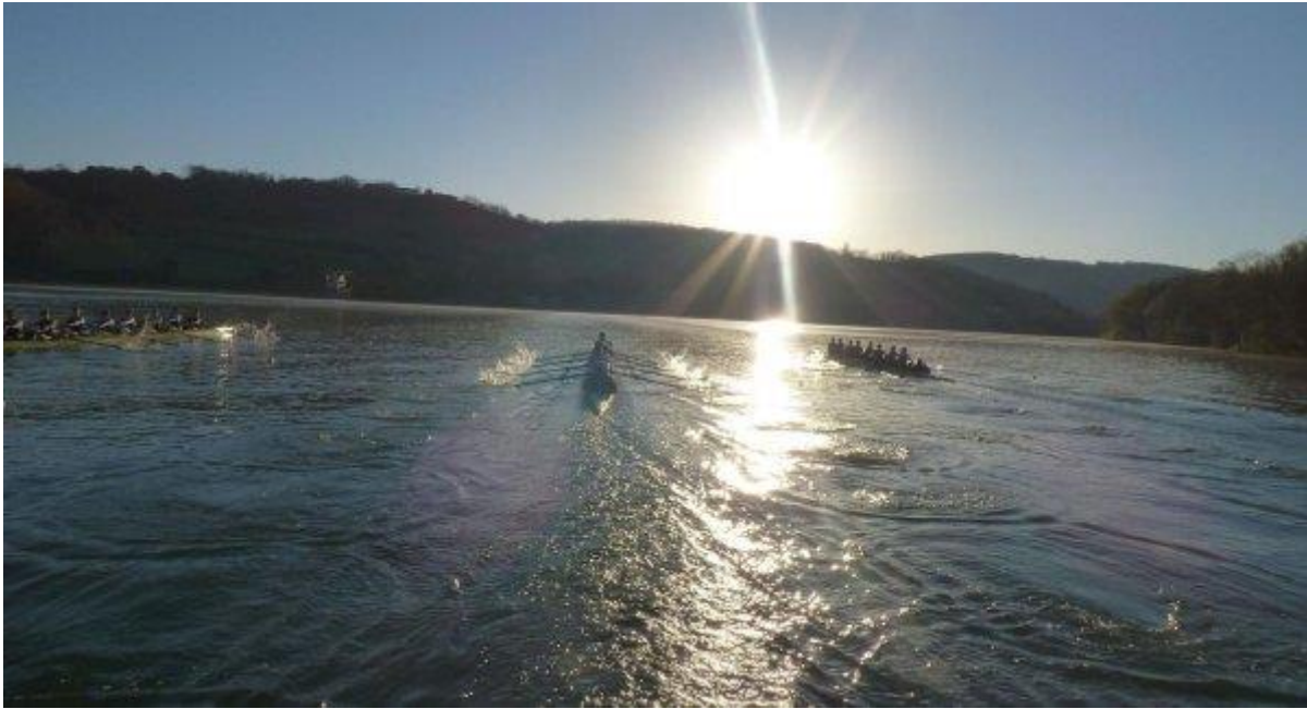
J16B, 2nd and 1st VIIIs on the course

The Boat Club held its annual Senior and J16 rowing camp at the 2000m rowing lake at Lissac-sur-Couze near Brive-la-Gaillarde in France, while the J15s travelled to Pangbourne in Berkshire for a week of training sessions on the Thames.