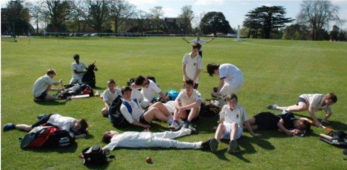
Recovering after an intensive training session

It was clear that most of the squad had given their all at our high-intensity net session. The team had suffered, but they knew it was all part of becoming highly tuned athletes.