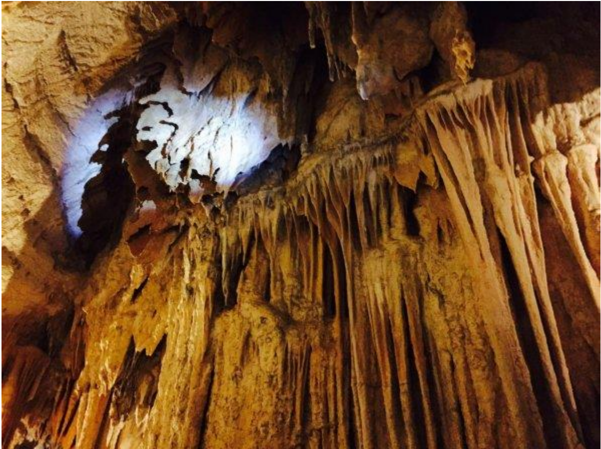
Les grottes des demoiselles