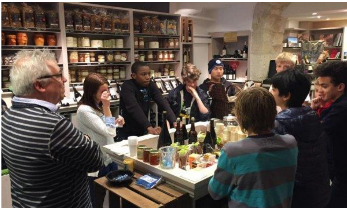
La dégustation de produits régionaux