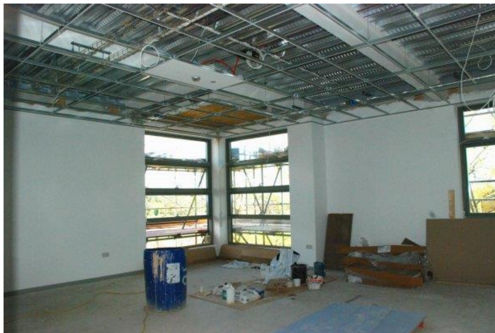
One of the 19 classrooms