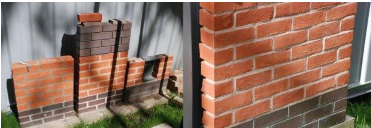
Bricks and mortar - four different samples to ensure the closest match with Oldham's Hall next door

Great care has been taken with the building of the new 19-classroom Academic Block, for example, to ensure that it not only provides a quality teaching environment but also that it fits and blends well with the other buildings on the site – particularly with Oldham’s Hall, one of the most attractive buildings on the site and immediately adjacent. “It’s a modern building – designed by Old Salopian Adrian James (S 1976-80) – but simple and solid-looking in its design and with a colour palette that ties in as closely as possible to Oldham’s. We’ve been very careful, for example, with details like matching not only the brick colour of Oldham’s but also the colour of the mortar.”