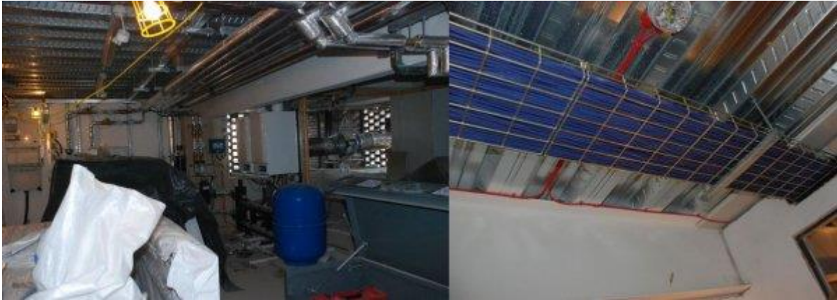
Left - the boiler room; right - IT cables

During the summer holiday, the History, Geography, Philosophy and Theology, Business Studies and Economics Faculties will take up residence in their brand new home and lessons will begin there on the first day of the Michaelmas Term. The official opening will take place on Old Salopian Day, Saturday 3rd October.