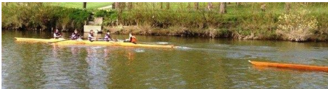
The crew crossing the line with plenty of clear water to spare between them and their rivals

They finished in a very respectable third place, which leaves School House in a commanding second position in the overall rowing standings for the year so far, challenging for the Leadbitter Cup and Birt Trophy.