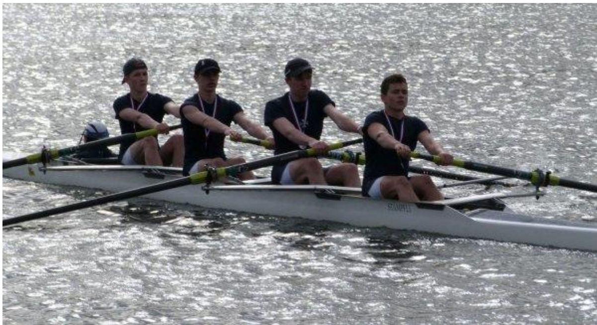
J16 coxed four

It was a tremendous day of racing for the J15 squad, and to come away with a gold and a fourth place showed great strength in depth. The hard work starts now in preparation for the National Schools' Regatta at Dorney Lake in five weeks' time!