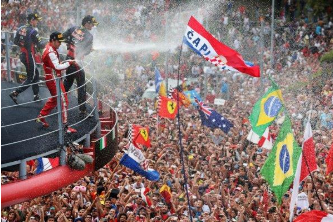
The winners' podium didn't look like this...