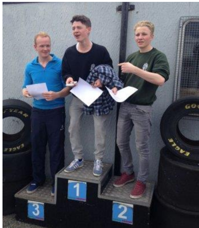
But it did look like this...