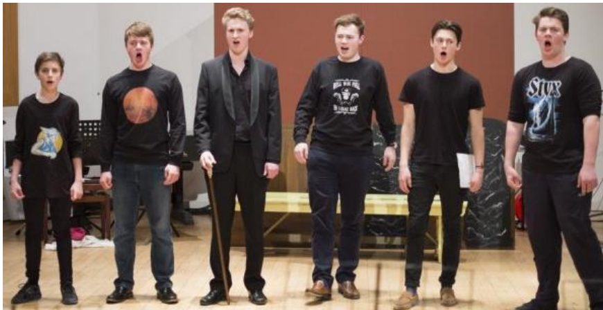
"Cherchez la femme"