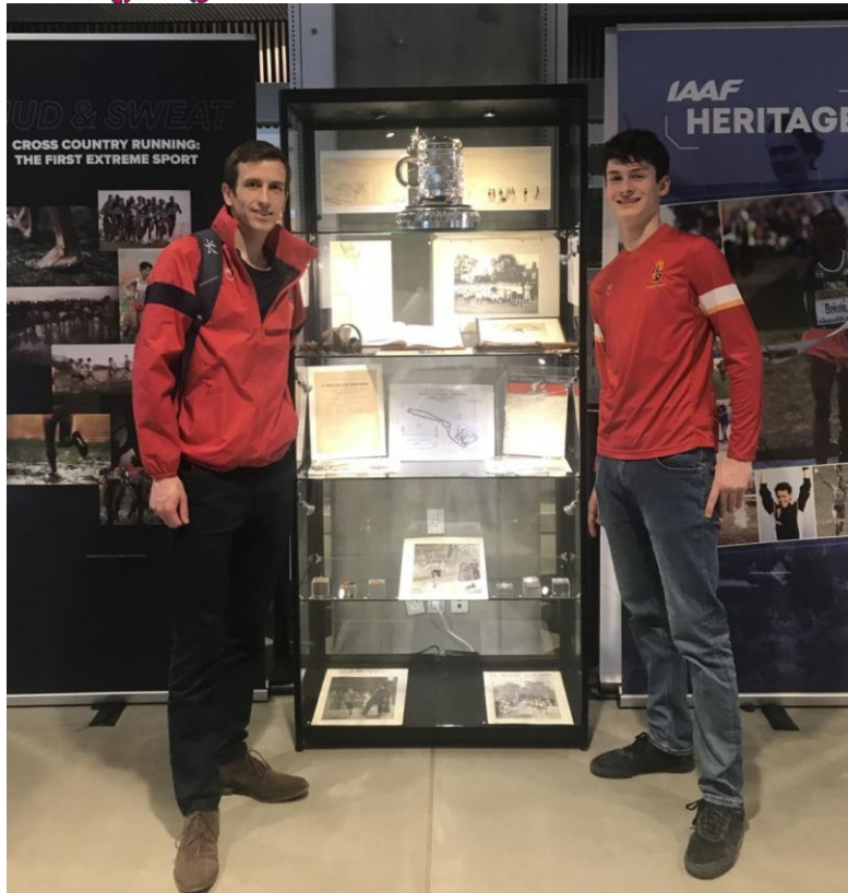
The Royal Shrewsbury School Hunt display