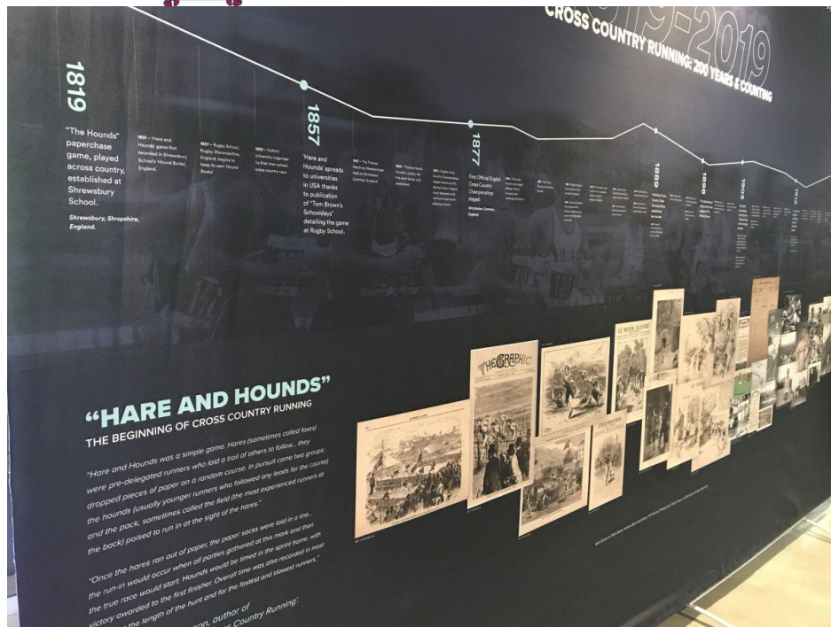
Timeline showing the history of Cross-Country - beginning with Shrewsbury School in 1819