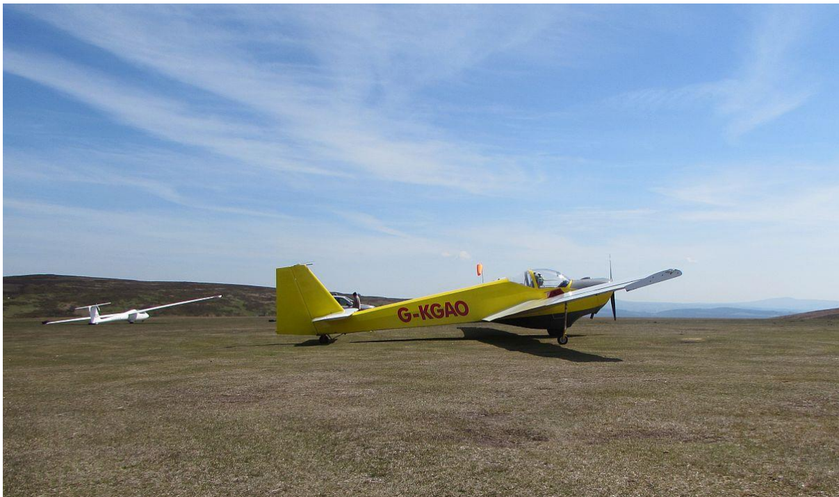
Falke 2000 motor-glider