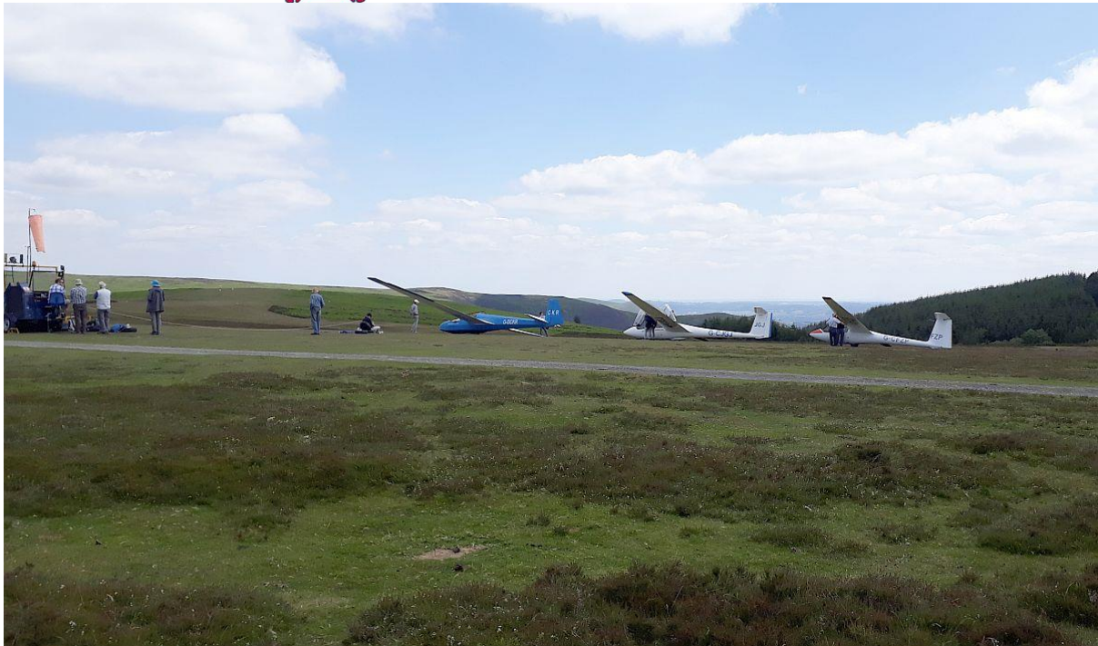
Gliders queuing to launch