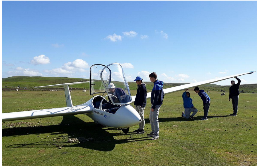
The cadets completing a Daily Inspection of the K21

The training during the week is not just about controlling an aircraft, but also the accompanying aspects of aviation. Students attended a morning briefing regarding the layout of the airfield each day, based on interpreting weather maps and cross-sections of the air mass over the Club. In addition, being an effective member of the ground crew is essential.