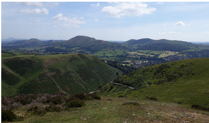
View east from the Long Mynd

Situated on the Long Mynd just a few miles south of Shrewsbury, the Midland Gliding Club often provides the ideal conditions for soaring flight, coupled with the exciting challenge of landing atop a hill, as well as exquisite views of the surrounding Shropshire countryside.