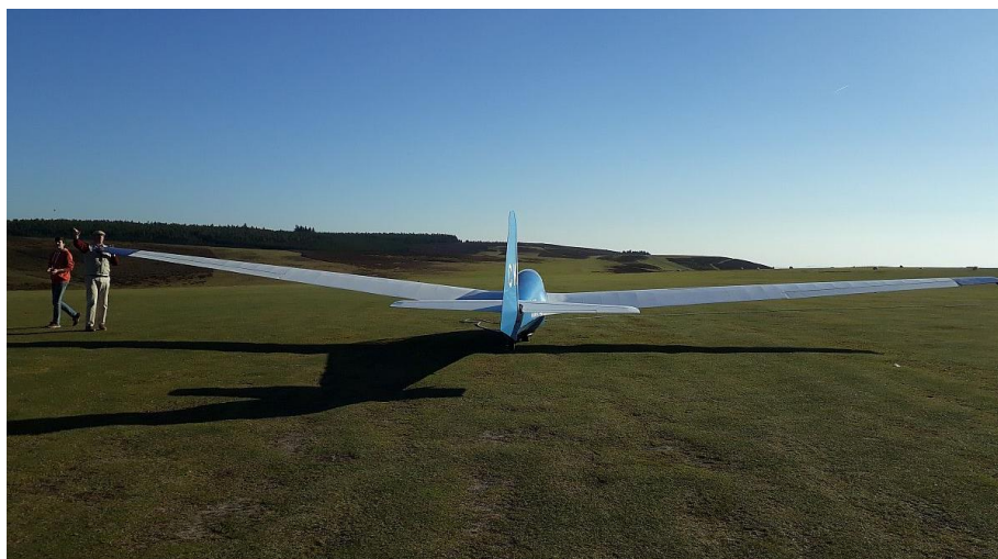
Launching a K13 to the south

As June and the Summer Term were drawing to a close, a sustained period of high winds and significant rainfall threatened the success of the 2019 Gliding Camp, scheduled to take place from Sunday 28th June to Friday 5th June. However, the sun fortunately broke through just in time and, for the first time in five years, the cadets were able to fly all day and every day of the Camp.