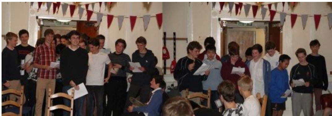
Sixth Form and Third Form sketches