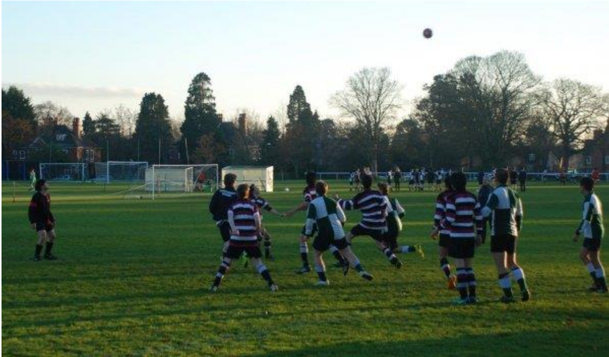
A pause in the School House - Ingram's game as Jupiter is spotted low in the sky