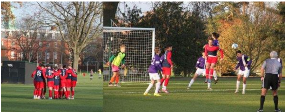
1st House finalists