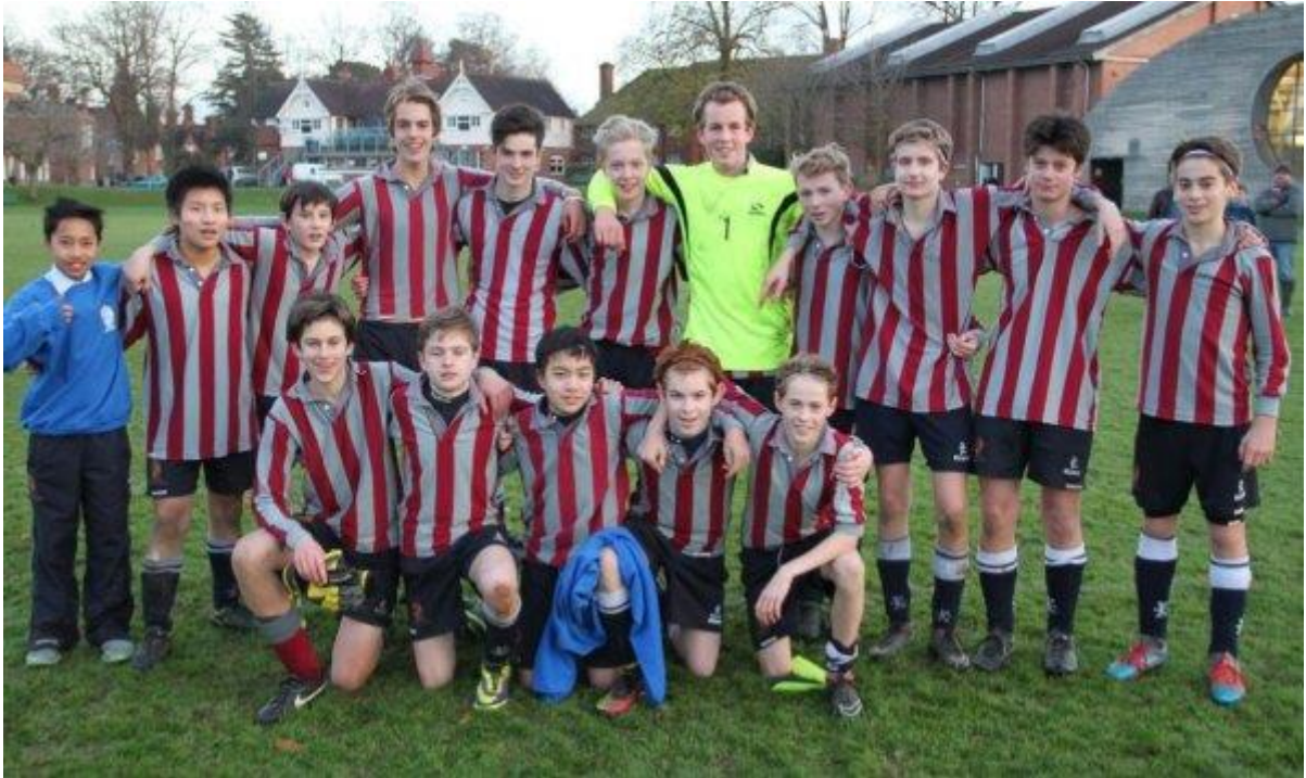
15 House winners