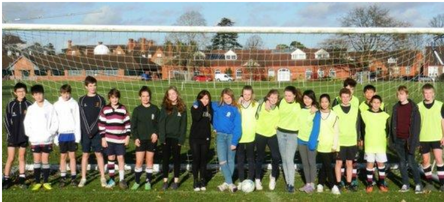
The teams before the game

What better way to mark the end of a successful first term of full coeducation at Shrewsbury School, than with a mixed football match?