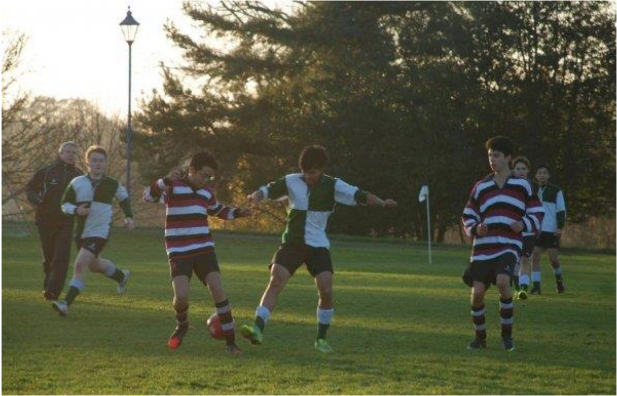
A rather irritating worm distracts the players during the School House - Oldham's Second House match