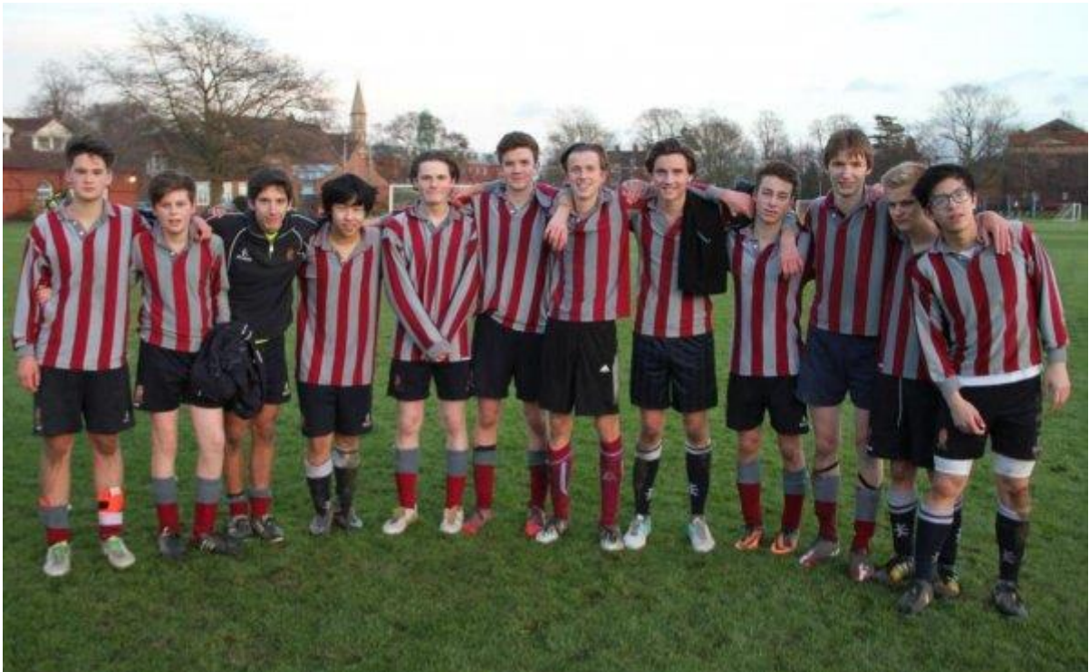
2nd House winners

In a spectacular end to the House Football season, Severn Hill won the 2nd House trophy, beating Port Hill in the final, and also claimed the 15 House title, beating Ridgemount on penalties. A clean sweep was not quite within our grasp, sadly, as we were defeated in the final of 1st House by Radbrook.