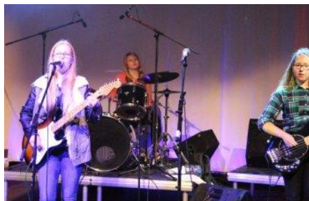
The Stars of '99

The evening raised a tremendous £900 - many thanks to all who supported it.