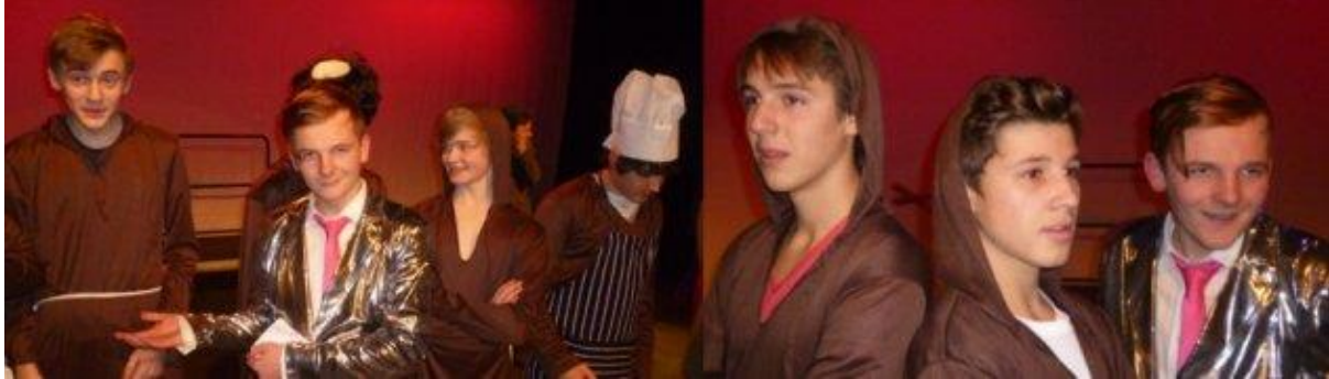
The Grove House Play 'Ten o'clock Angel' - rehearsal shots. Please also see slideshow below

The Grove House Play was a tale of the eternal battle of good against evil, with some light touches and a good dose of comedy - most of it intentional! 'The Ten o'clock Angel' told the story of a not so good angel and a goody-goody demon coming back to earth for retraining at a remote abbey, and their antics with the members of that holy order. Set against this, the backdrop of a game show filming there with a special prize of an angel's blessing, and you have something of the plot.