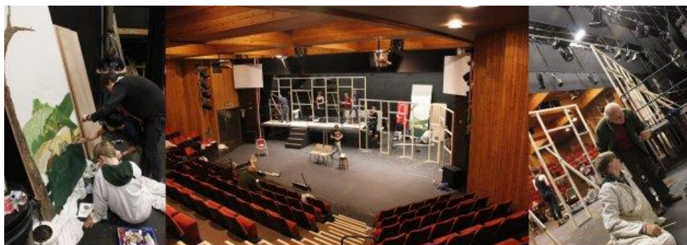
Rehearsal shots from Churchill's 2012 House Play 'Noises Off'