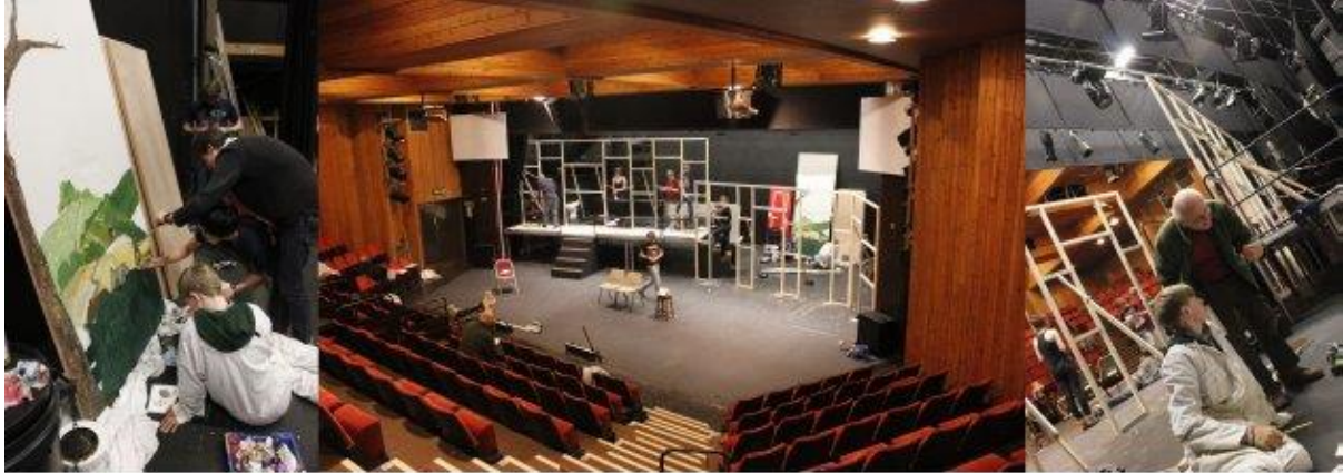
Rehearsal shots from Churchill's 2012 House Play 'Noises Off'

On Thursday 9th and Friday 10th February at 8 pm in the Ashton Theatre an all-star cast from Churchill's Hall with help from Shrewsbury High School for Girls will be producing Michael Frayn's 'Noises Off', a play which has been dubbed by one well-known critic as 'the funniest farce ever'. It's actually two plays rolled into one. You will split your sides with mirth as our hapless actors stumble their way through a technical rehearsal of a dreadful comedy of sexual misunderstanding entitled 'Nothing On'.