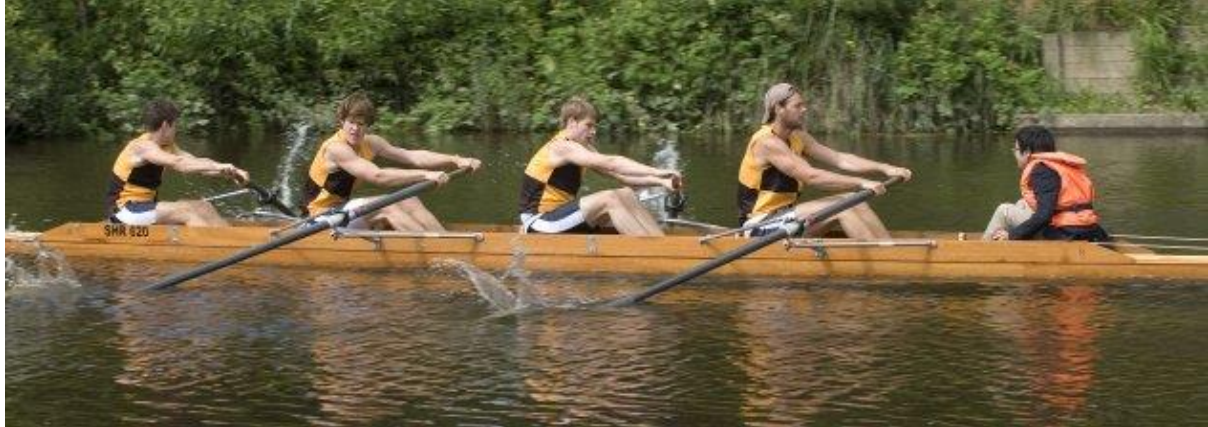
Rigg's I - Head of the River 2012

The weather forecast turned out to be correct – torrential rain – which unfortunately caused the disruption elsewhere is the speech day programme. It may be an overused phrase, but at the river it was a case of “Keep Calm, and Carry On”... (looking at the volume of water flowing into the river, this would not have been the case tomorrow!).