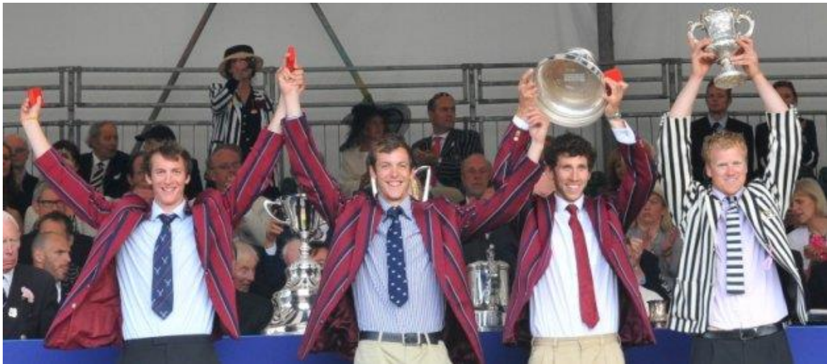
10 Old Salopians competing at Henley. A long list (and please forgive any omissions or errors).