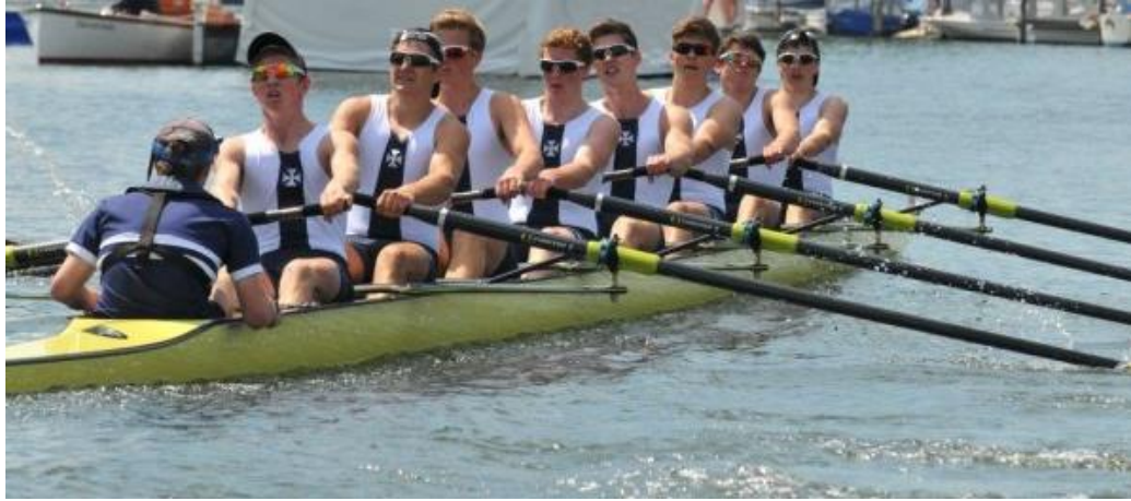
1st VIII in action against Bedford Modern School

themselves in the lead and develop a strong rhythm to control the race through to the finish and set up a second round match against National School's bronze medallists Hampton.