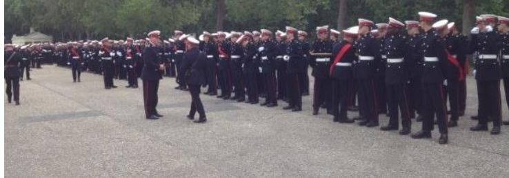
Royal Marine Cadets forming up at Wellington Barracks

On 6th July, I took five boys to Whale Island, Portsmouth to prepare for the Royal Marines Cadets 350 Parade to commemorate the 350th anniversary of the founding of the Royal Marines. We arrived at the Royal Navy Headquarters and the boys settled in aboard HMS Bristol. There were 30 lads to a room in bunks of three - a great experience for them to see what life is like on board a ship.