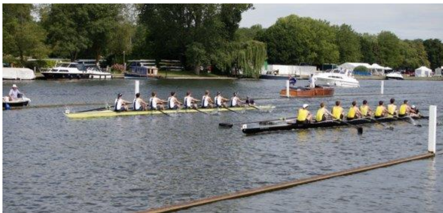
Final stages of the race vs Hampton