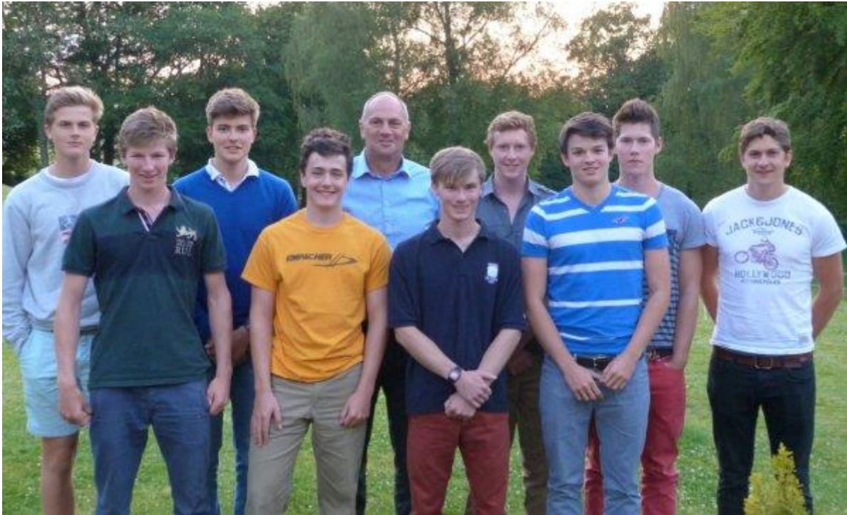
1st VIII with Sir Steve Redgrave

The 1st VIII competed at the 175th Henley Royal Regatta held from the 2nd to the 6th July. The crew raced in the Princess Elizabeth Challenge Cup event for school VIIIs along with 31 other crews in the side by side knockout competition.