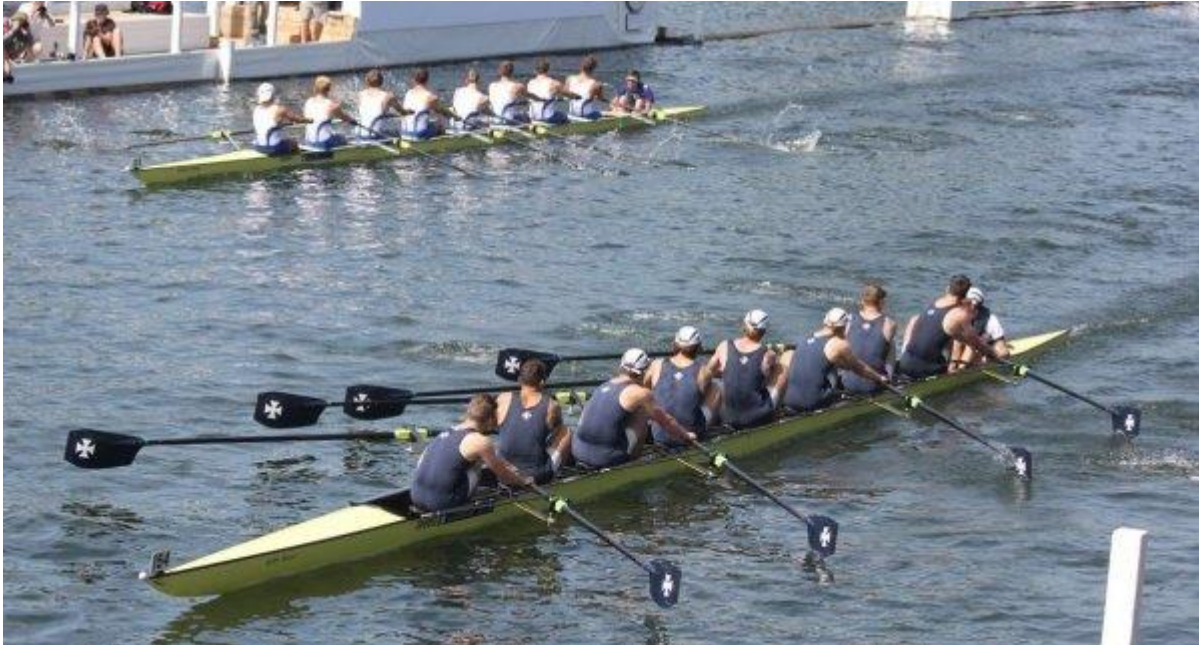
The 1st VIII against Bedford

On the Friday the 1st VIII met another selected crew in the form of Bedford School who had come 4th at the National Schools' Regatta. A tightly fought contest saw the 1st VIII take a small lead off the start which they maintained and used that cushion to respond to Bedford pushes down the course. The crew recorded a win by one length.