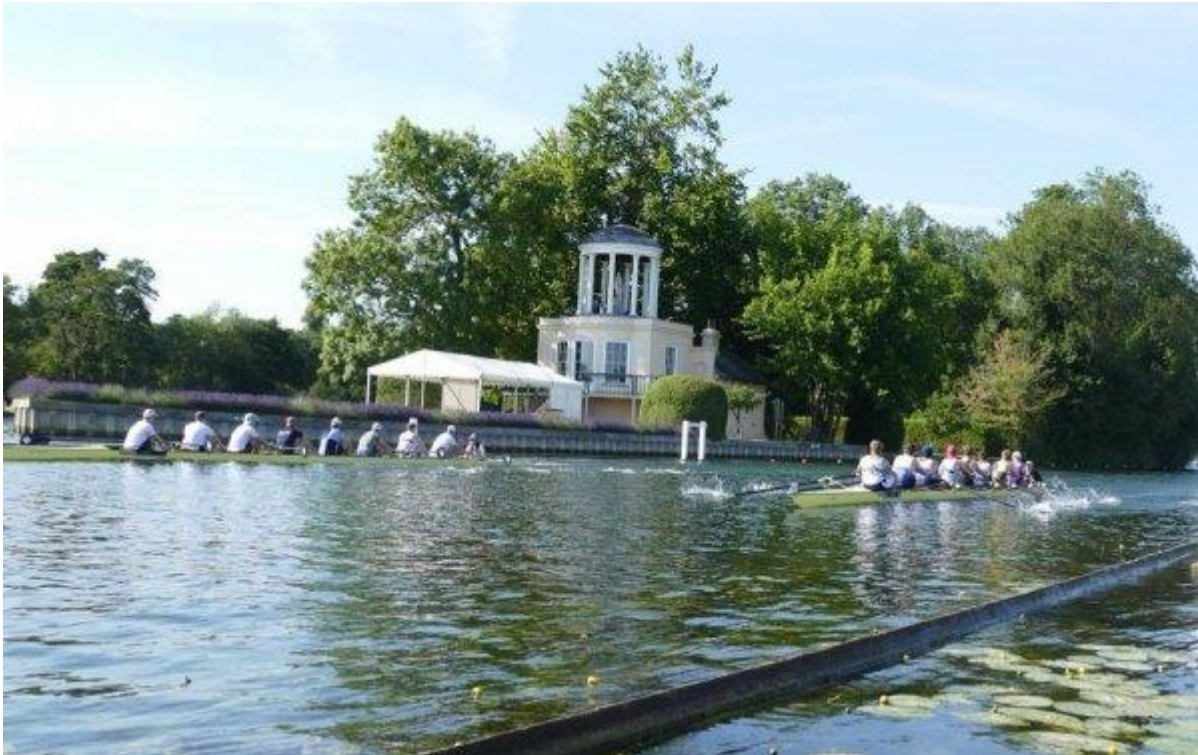
1st and 2nd VIs training

For the first time in nine years the 2nd VIII successfully made it through the qualifying races for the Temple Challenge Cup; the Sabrina crew raced in the Thames Challenge Cup for the second time in three years; and the 1st VIII raced in the Princess Elizabeth Challenge Cup.