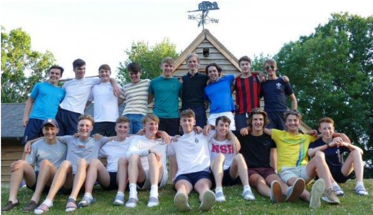
1st and 2nd VIIIs

The races can be viewed at the following links: