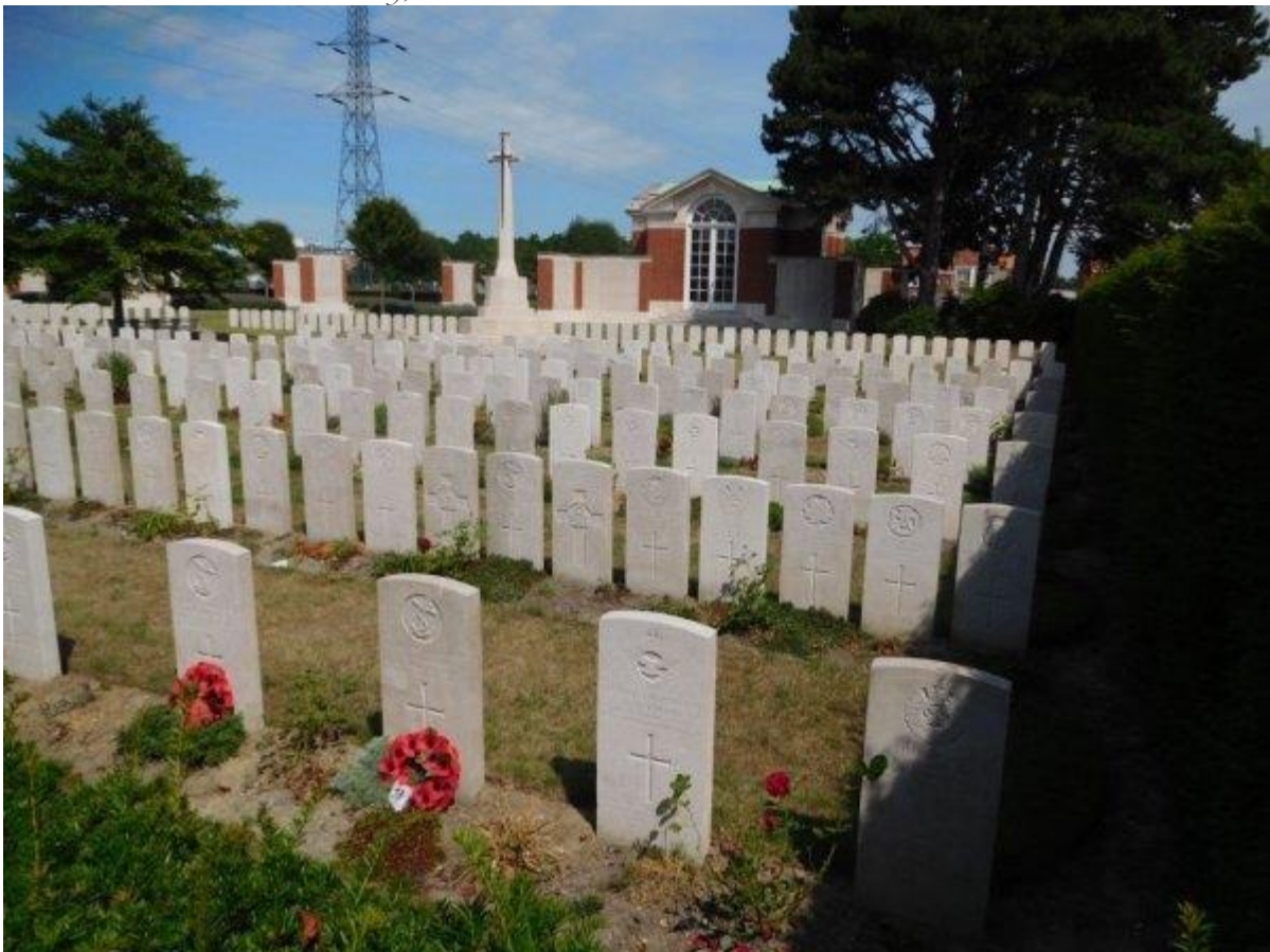
Dunkirk Town Cemetery

Buried at Dunkirk Town Cemetery, France. Grave IV. C. 4.