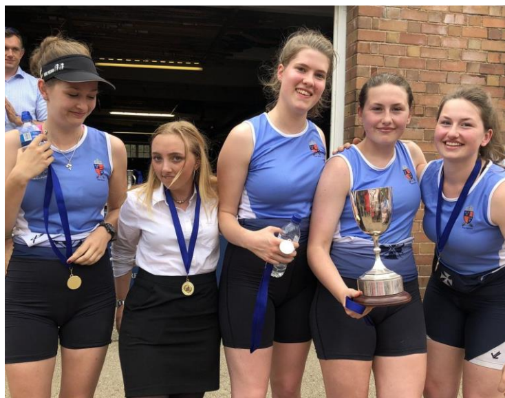
The Grove with the Elizabeth Cup

Oldham’s took the Head of Division 2 away from Radbrook. Port Hill bumped down in every race. Ingram’s finish at the foot of Division 2 for the sixth successive year.