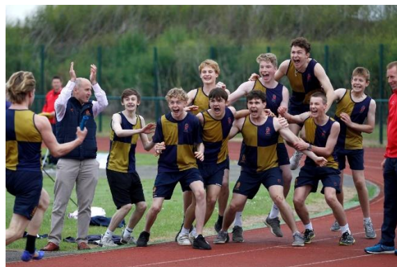
Ridgemount winning the Senior Cannon Relay