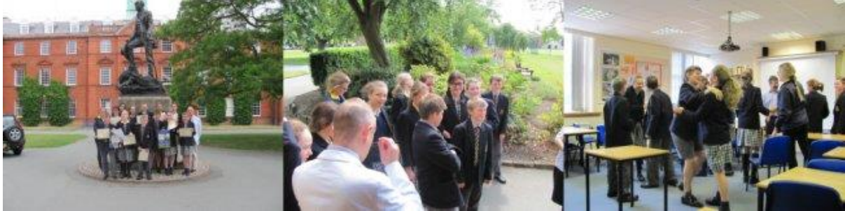
St Richard's at Shrewsbury - having a guided tour (in French) and learning to greet in German

We were delighted to welcome the St Richard's School scholarship class for a Languages Day on Thursday 16th June.