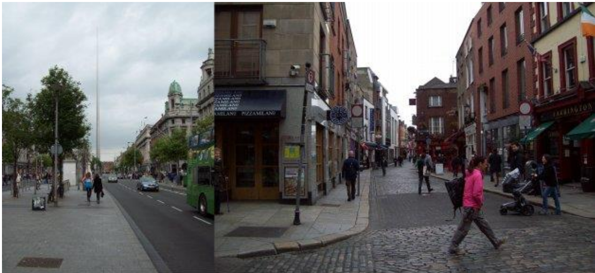
Left: O'Connell Street with the Dublin Spire in the background Right: Temple Bar

Dublin seems a lot more cosmopolitan than on my two previous visits. Last time I was here was at the start of the Eastern European Diaspora, but now there seems to be a lot of foreign students – many from South and East Asia, Africa and the Middle East. The Eastern Europeans are still here and appear to be most of the people employed in retail and tourism – an excellent geographical case study. This seems to have had a beneficial effect on the city as the number of ethnic restaurants has definitely increased. This has only confirmed my opinion that Dublin is still my favourite European city, even though it reminds me of Liverpool a lot!