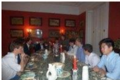
Fish Course at Dinner