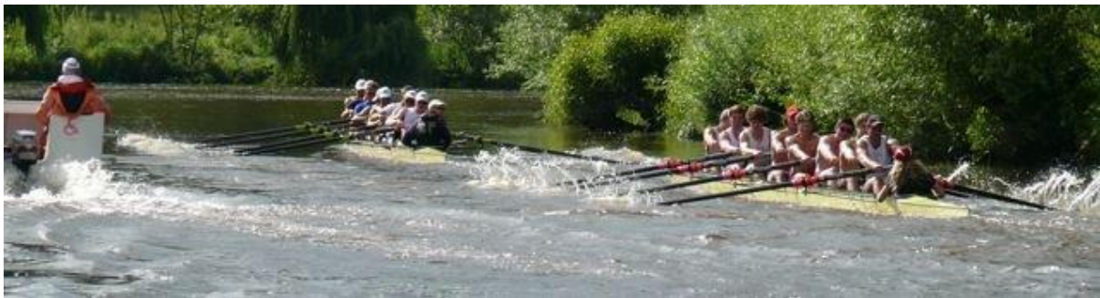
Shrewsbury hunting down Gonzaga in a time trial on the Severn on Monday

Certainly our boys have a point to prove after a disappointing National Schools, however spirit is high for another good run. The crew depart on Friday for their Henley base.