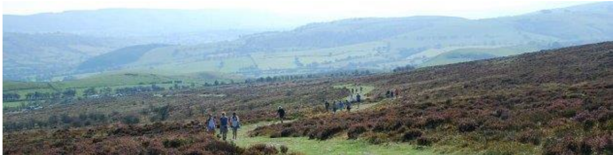
The sponsored walk across the Long Mynd September 2011 that raised £50,000

Since September, when the whole school walked back from the Long Mynd on a glorious sunny day and raised £50,000 for Shrewsbury House, the school has gone on stepping out to raise money for charity.