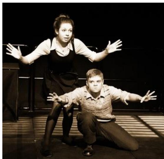
The Arsonists, Senior School Play 2012