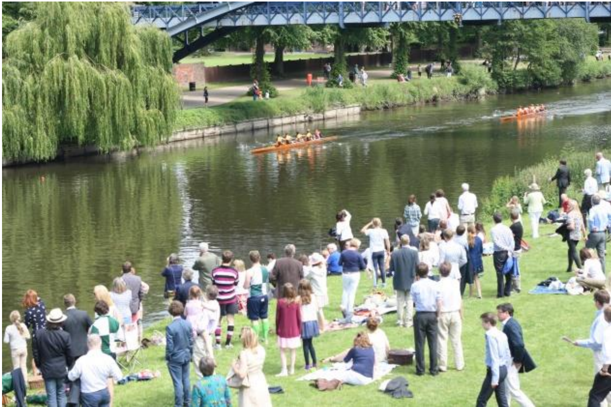
Rigg's III rowing over to win Division 3

In division three Rigg's faced a challenge for the head from the rapidly rising Port Hill. Rigg's held firm with a crew mainly made up of third formers, to row over the course, and claim the win. At the other end of the division, Mary Sidney held off Severn Hill, and so Mary Sidney finish off the foot of the division for the first time in their (short) history.