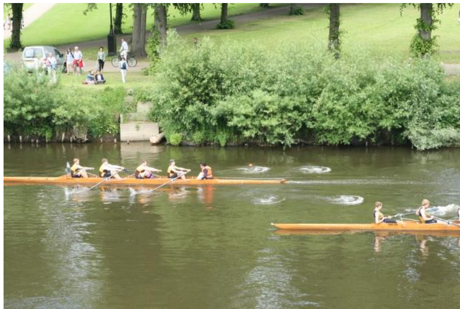
Ridgemount bumping Rigg's in Division 2

In the second race of division 1 on Friday Moser's came within 1 foot of bumping Rigg's, today was to be the rematch.