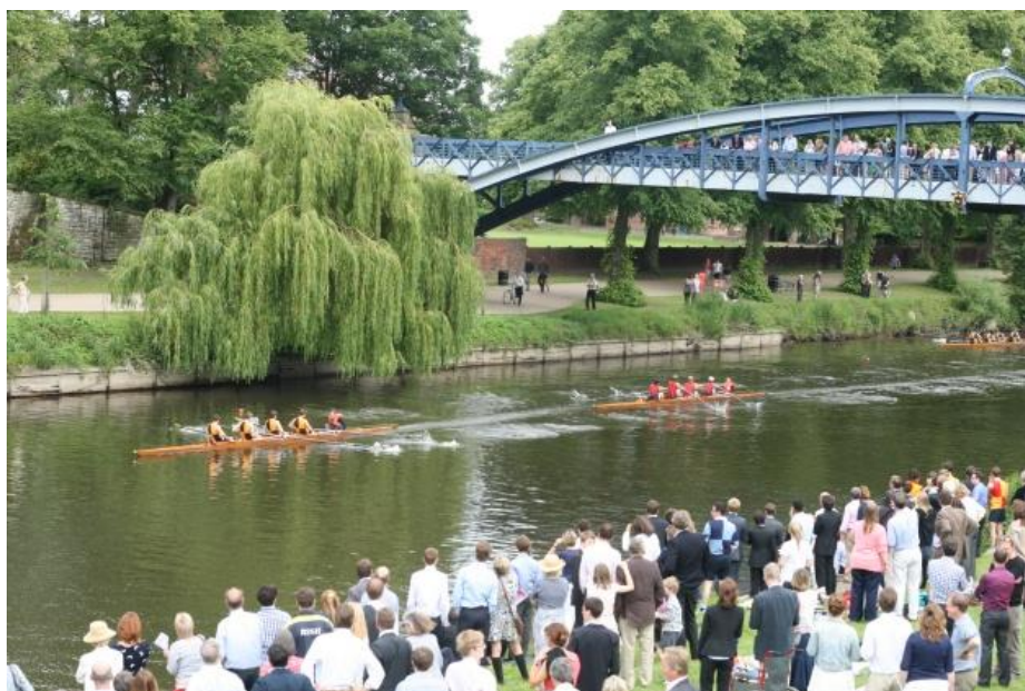
Moser's chase Rigg's for The Head of the River in front of the Shrewsbury Roar

Both crew set off with intent, with Moser's closing gradually past the boathouses to roars of approval from the massed spectators. Around the Pengwern corner Moser's gained overlap, and it looked for a moment that they might get the bump, but once again they were 1 foot short. Rigg's earn the title of Head of the River for the fifth straight year.