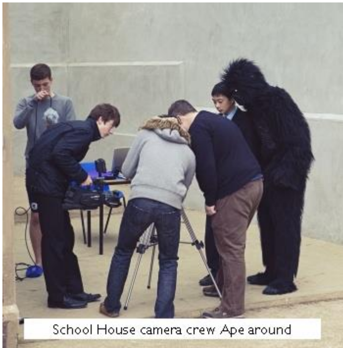
School House camera crew Ape around