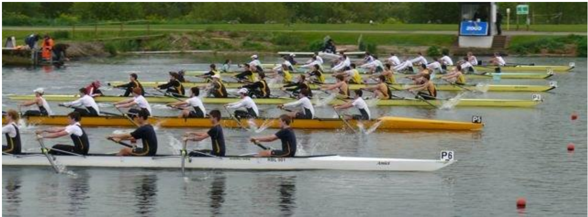
2nd 8, at the start, final IM3 8's