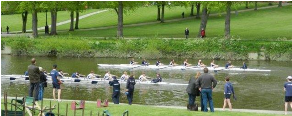
J14B 8X v Girls 8