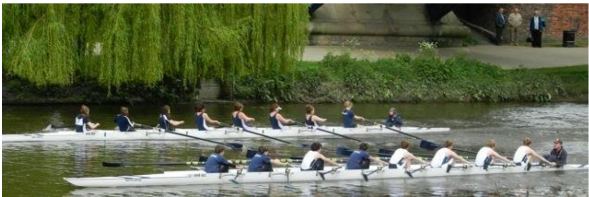
J14B 8 v Girls 8