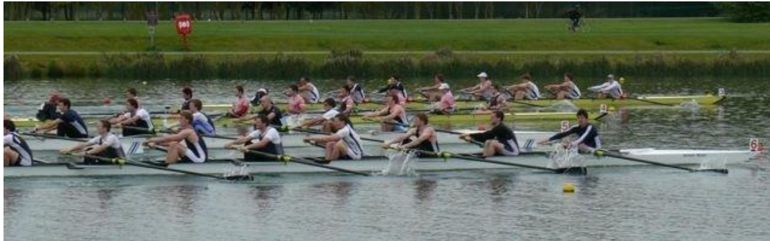
RSSBC 1st 8 leading the pack (far side) in IM2 8's Wallingford Regatta

For the first time in three years, the weather at Dorney for the annual Wallingford Regatta was benign - such a bonus!