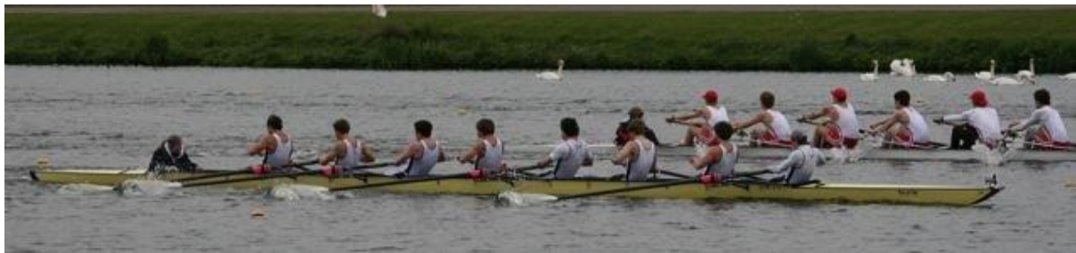
1st 8 leading Radley, Final J8's

Our crew was in the first of 2 heats, 3 from 4 to the final; after 500m our crew were heading Hampton by a canvas when they decided that 2nd place was good enough for them. Radley won the other heat, setting up a juicy final. However, due to an illness within their crew Hampton withdrew from the final and left our crew to win the event by a length over our old adversaries Radley.