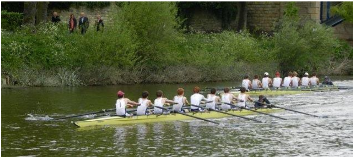
J15A 8 v J14A 8X