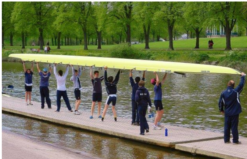
Preparing for the time trial