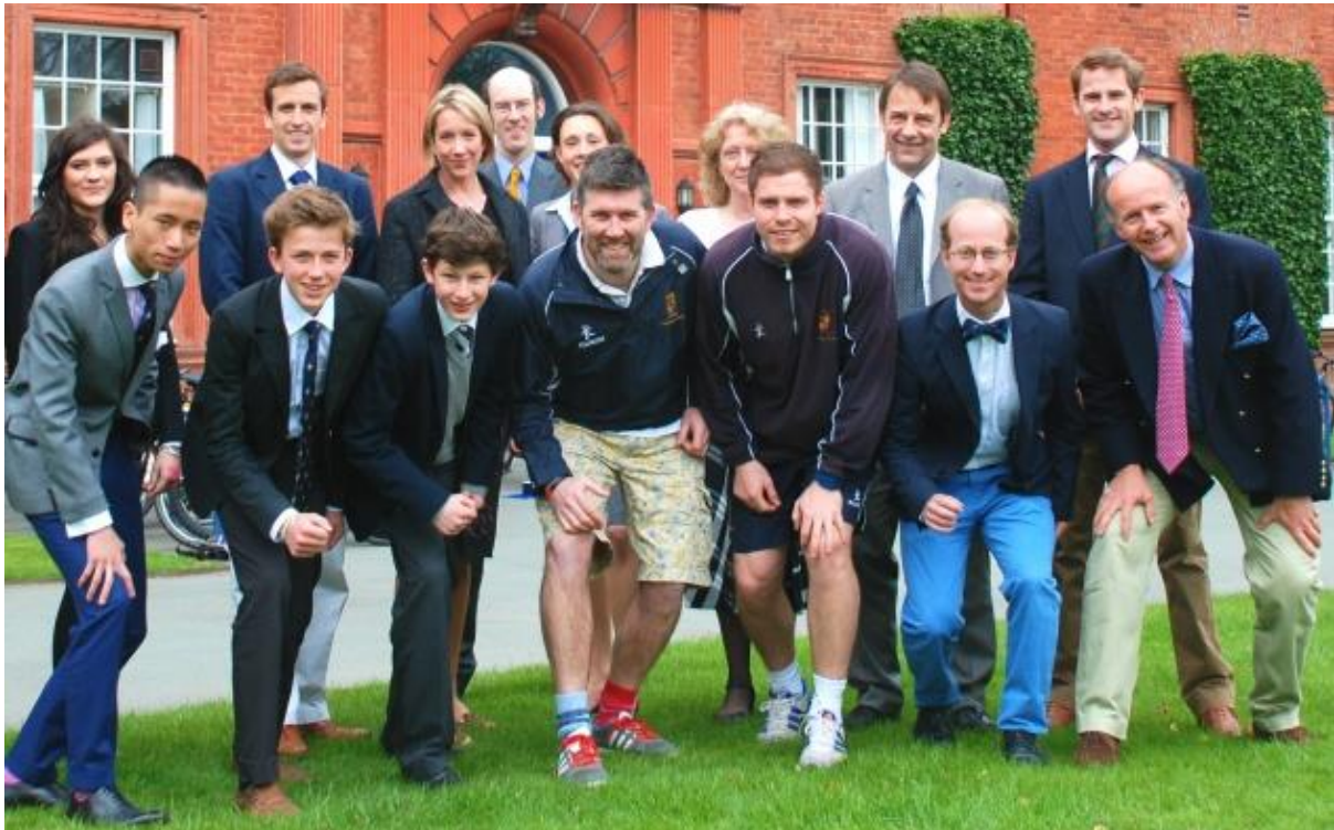
Putting their best foot forward... a few members of the School's Shrewsbury Marathon Team and supporters