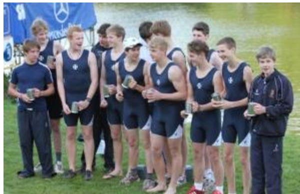
Members of R.S.S.B.C J15 squad after collecting their first pewter Regatta tankards on Saturday

The A crew were split into two crews of around the same speed. One had to race a club crew from Northwich in a semi-final before a big grudge match against their own team mates. This race was eventually raced on Sunday; the margin two-thirds of a length.