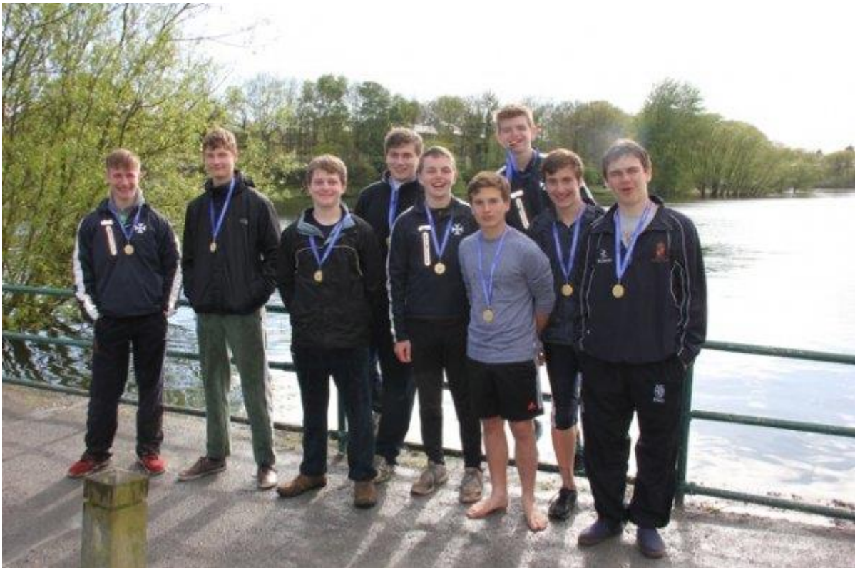
The winning J15 VIII at Birmingham

The J15 eight won gold and the J16s put up an excellent showing but came second. In their first experience of side by side racing, the J14 quod won one of their round robin races, but the two octos lost their races. Please see the full report: Birmingham Regatta, 26th April 2014