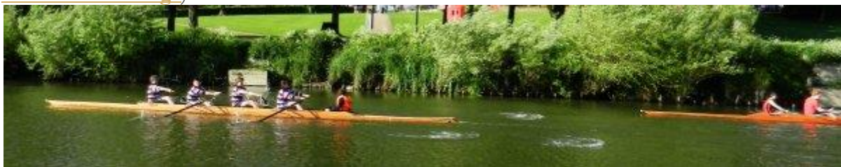
The boys cruising to victory in their final race to secure maximum points for School House

Odds-on favourites to win the competition, the biggest question was whether we could get maximum points by leaving clear water between us and all the other houses. Will Dodson-Wells' team answered emphatically by leaving everyone else in their wake. (See results table: Senior IVs - Week 3 standings )