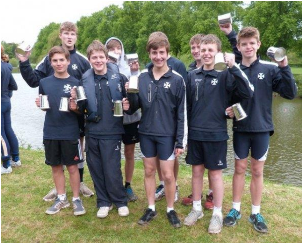
J15Bs with their Shrewsbury Regatta pots

“Yet another nail-biter against another more able Abingdon RC crew gave us confidence going into the final. What we did not expect was to be faced with racing our very own J16 As 4, who happen to be representing GB against France this exeat. Little did we know that the mammoth mismatch would play into our hands. We had little, if any, pressure to perform against the superior crew so were relaxed going into the final. The same race that we had experienced before played out, albeit with us much further behind than beforehand. In the final straight we again mustered what little strength we had left and pulled back to within half a length of our older counterparts before crossing the finish behind. Despite the loss, the journey from Novice to contending with a GB J16 4 was certainly a memorable series of events that I will treasure for the rest of my life.”