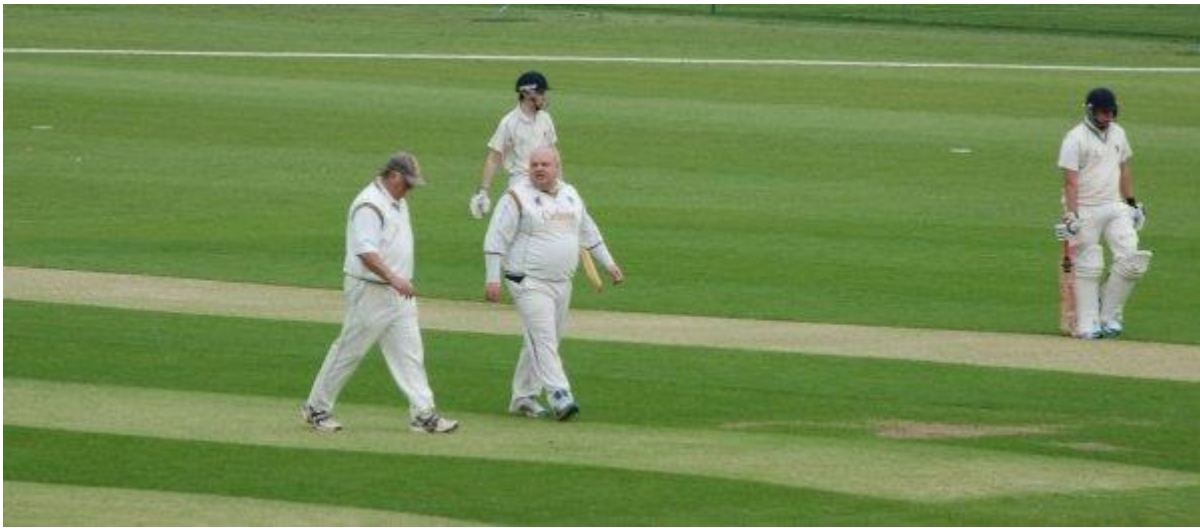
The XL Club discussing tea and the bun:run ratio