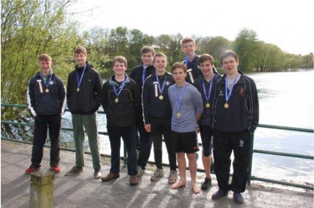
The winning J15 VIII

The boys have gained valuable race experience at this event which will prove to be very useful in the coming regatta season.