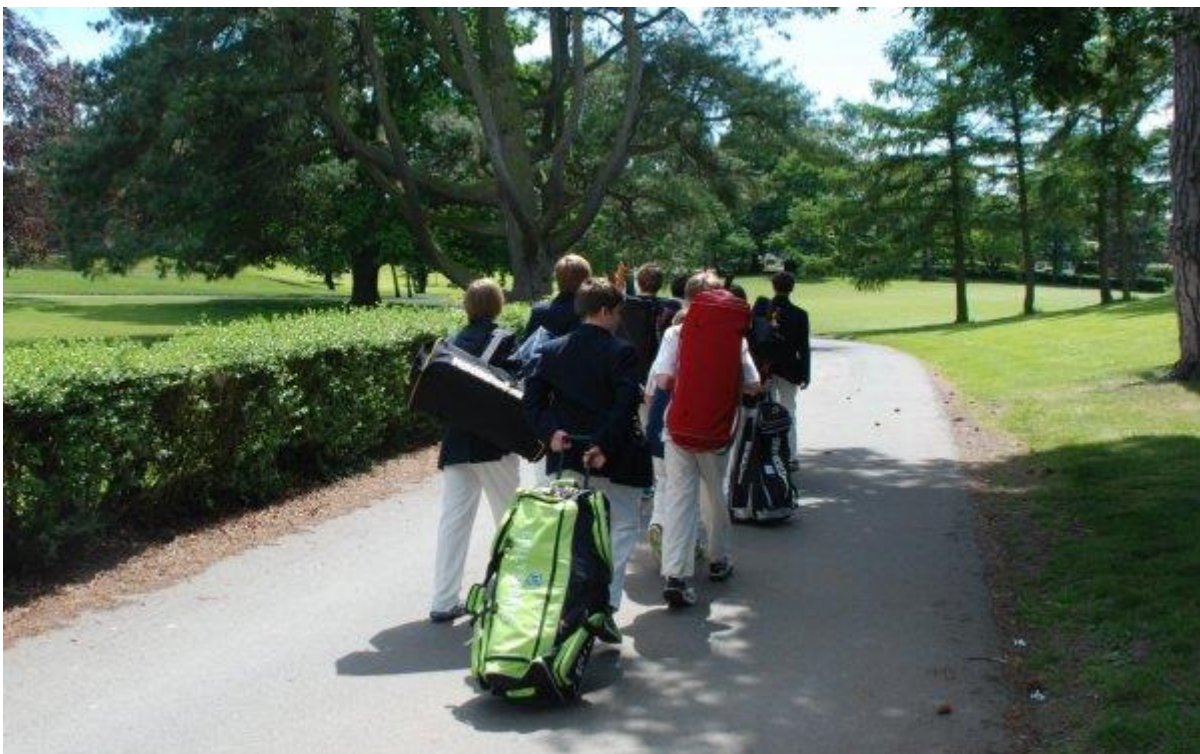
A team of 'walkers'

This week saw the team travelling to Shrewsbury High School Prep. I say ‘travelling’ but in fact we decided to walk, as the team took the impressive decision that they would prefer to arrive at the ground devoid of the sluggishness that can often be associated with coach travel. Obviously this was a carefully thought-out part of the coaching plan and I think it is something we may try again, although this will depend on the Headmaster allowing us a week’s (or possibly two or three) travel time to walk to our away fixtures.