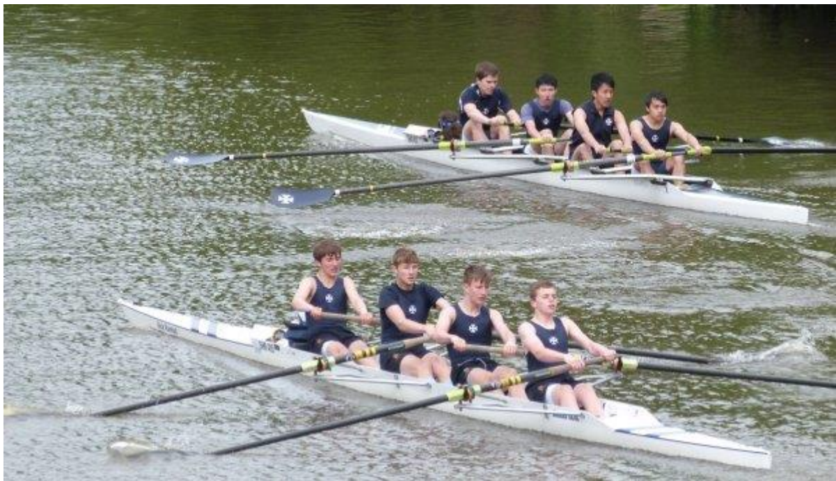
J15B IV (in the foreground) v 3rd IV

“On the Saturday our first race was delayed by a mix-up of crews, with the wrong Grosvenor crew in our opposing boat. Once this was resolved, we met a pretty unprepossessing crew of youngish men, who we promptly beat by three lengths. The second was a tad more gripping, after a member of our crew caught a crab in the start of the race, putting us back by two lengths. We inched back until pulling level at the Toll Bridge and pulling ahead. The third race we beat the Abingdon RC crew by ten lengths to win the title of Novice Club 4s. This victory put us in the situation of being effectively barred from Novice competition.