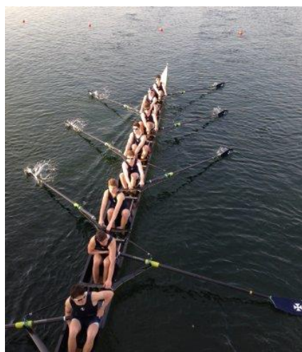
1st VIII on their way to the start