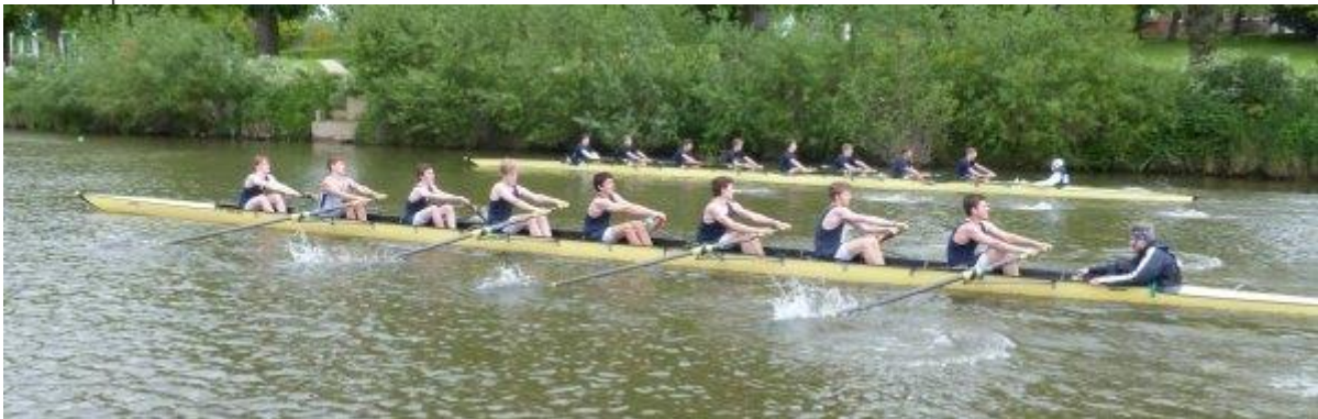
J15A vs J16B

Saturday saw some fine racing, the highlights being the J15B VIII pulling off a memorable win against the 3rd VIII at the second attempt – albeit that they were given a small advantage; they certainly produced a great finish. The As did a similar job, by beating a quick J16B VIII by two feet – a perfect result!