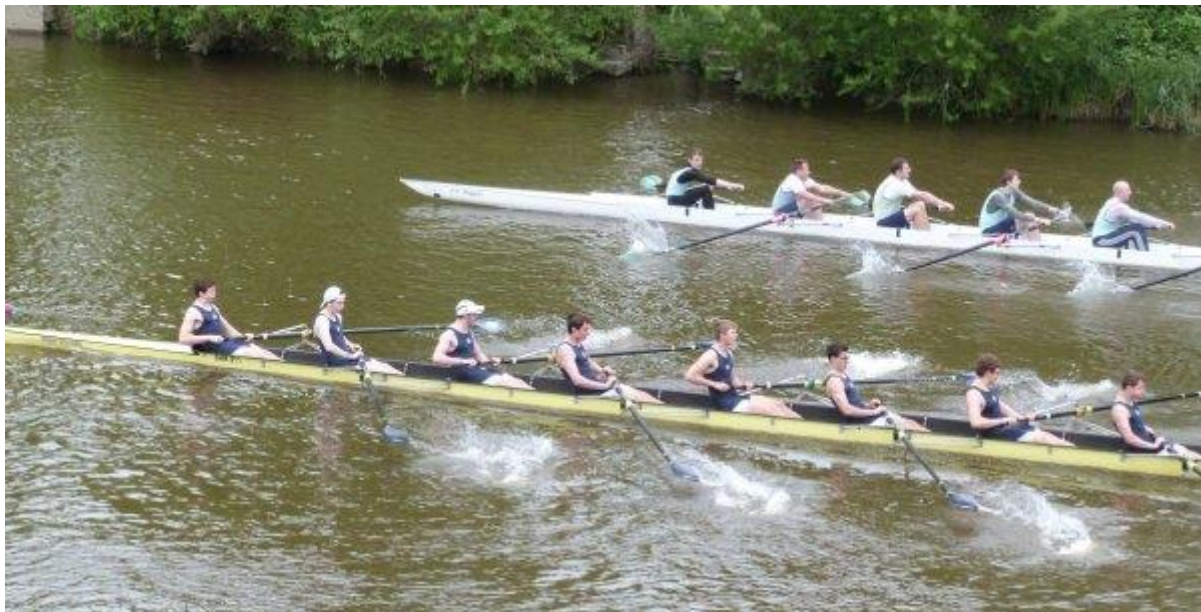
2nd VIII vs Stourport

The 2nd VIII won IM2 Eights after beating Sabrina in the second round and Stourport in the final. On Sunday they faced Stourport again in the final of IM1 Eights and went on to win the tightly fought race with a verdict of three feet.