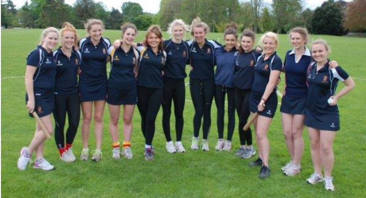
The Rounders Team