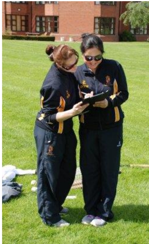
Coaches discussing tactics

The game of rounders has been played in England since Tudor times, with the earliest reference being in 1744 in A Little Pretty Pocket-Book where it was called "base-ball" by John Newbery. In 1828, William Clarke in London published the second edition of The Boy's Own Book , which included the rules of rounders and the first printed description in English of a bat and ball base-running game played on a diamond. The following year, the book was published in Boston, Massachusetts.