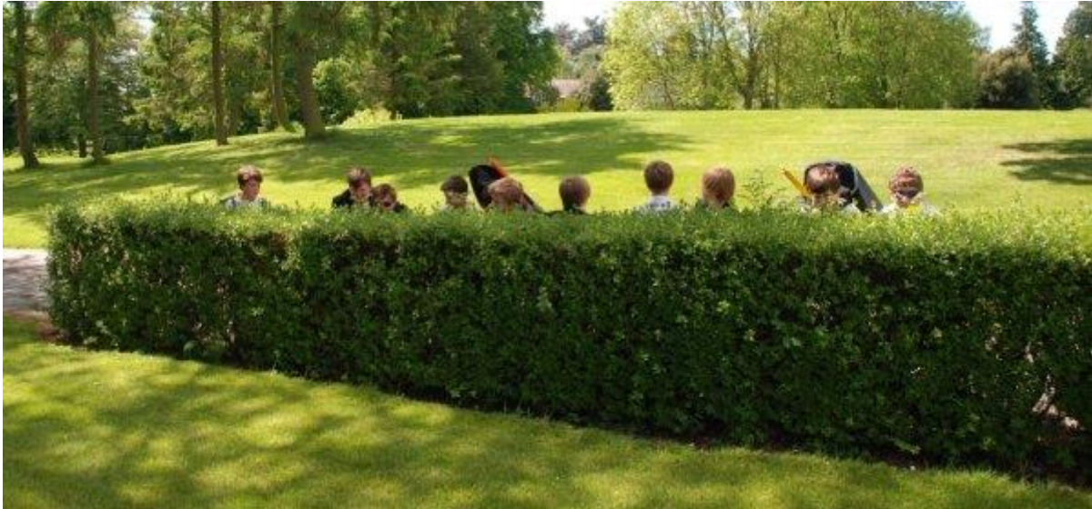
Taking the 'Hedge Test'

A concern when playing prep schools is not to over-intimidate the opposition with our immense height and so we made the players take the 'Hedge Test'; which involves ensuring no one on our team is more than a head higher than the top of the Kingsland House Hedge. The Hedge Test was of course made famous by one of my grandfather's close personal friends, Karl Jung, who believed it should be an archetypal test for all cricketers playing against younger opposition.