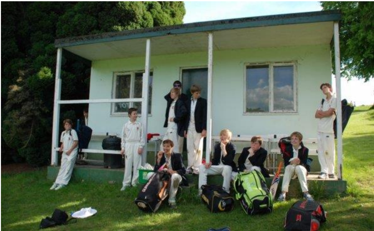
Contemplating the warm-down walk home at the end of another successful day