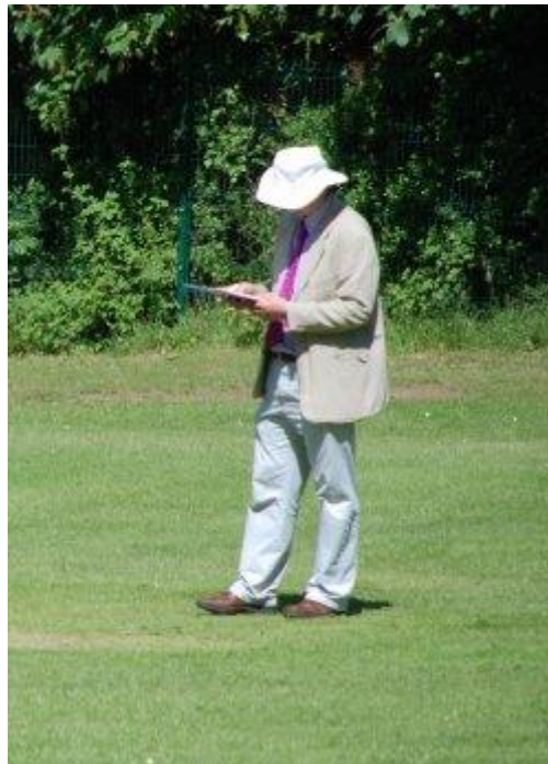
Your correspondent scoring and writing Team of the Week at the same time

As I am sure you all know, cricket at Shrewsbury is currently a very successful and thriving sport. Will it be in such good shape in four years' time? The answer must lie in the depth of talent in the under-14s and the standard of coaching. Just think how strong and healthy Salopian cricket will be if the under-14C team is a force to be reckoned with!