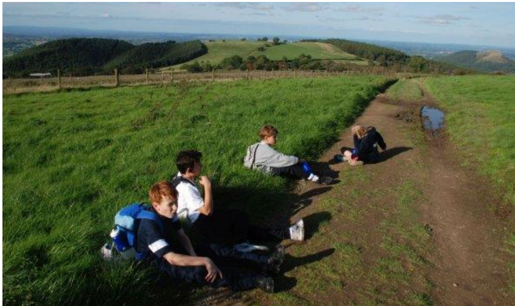
Pausing for a breather