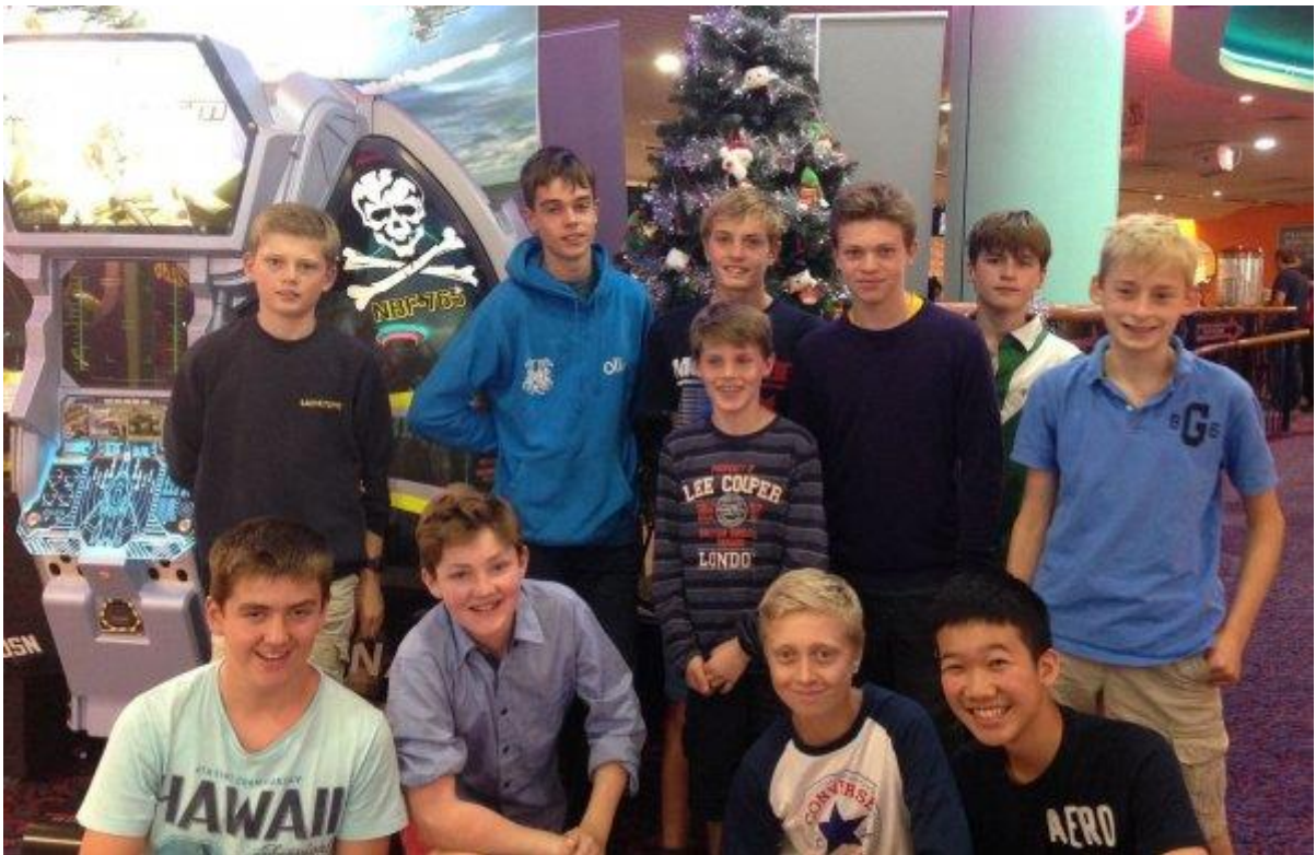
Bowling trip and meal out at the end of a packed first week