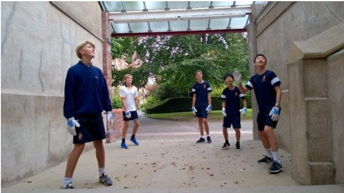
Introduction to Fives