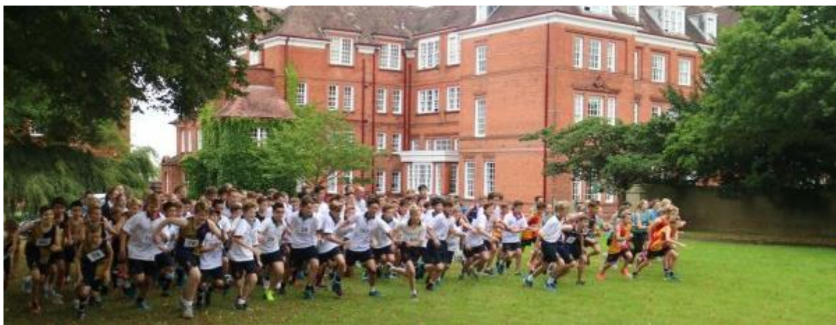
The start of the Third Form race, with School House in the background.