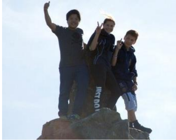
On top of the Devil's Chair