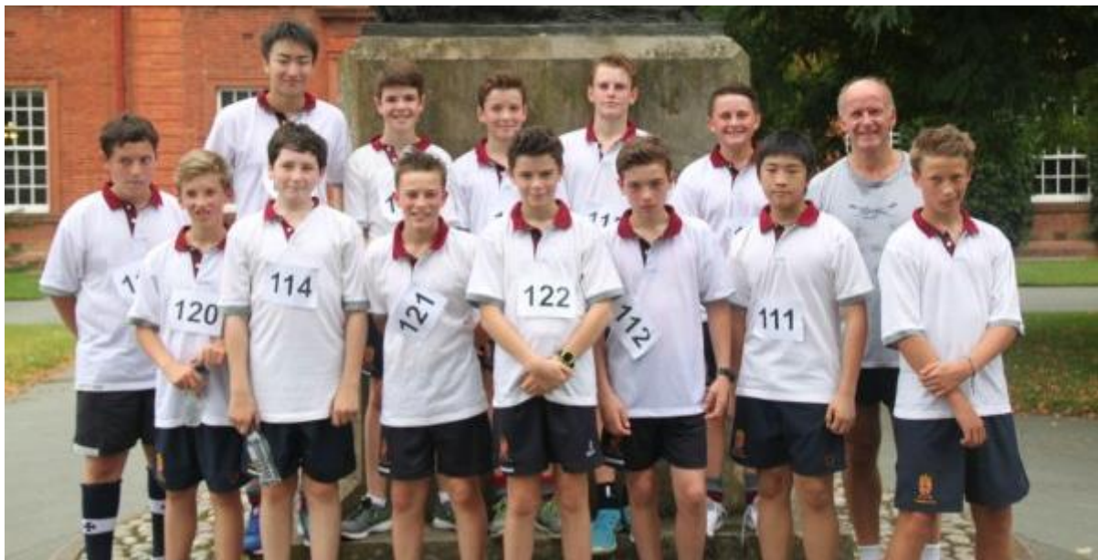
Severn Hill team