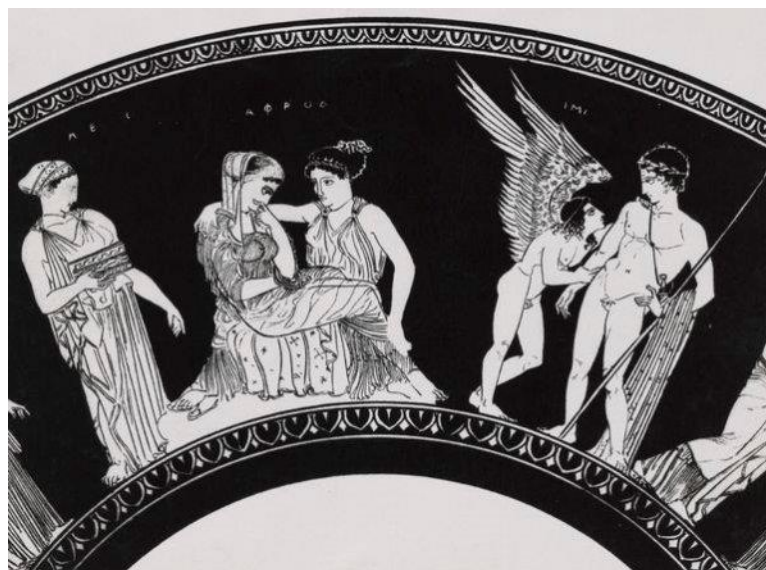
The goddess Persuasion (far left figure) on an Athenian red-figure amphoriskos, Heimarmene Painter, c. 430 BC