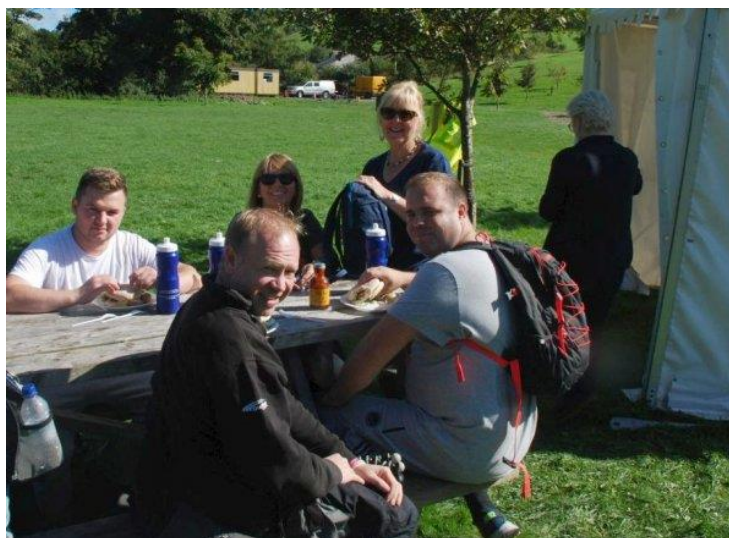
The Shewsy Team GJFB