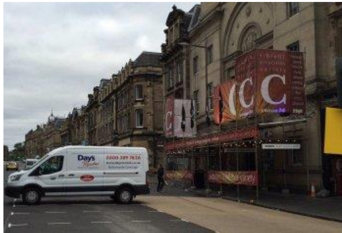
Early morning get-in for the crew