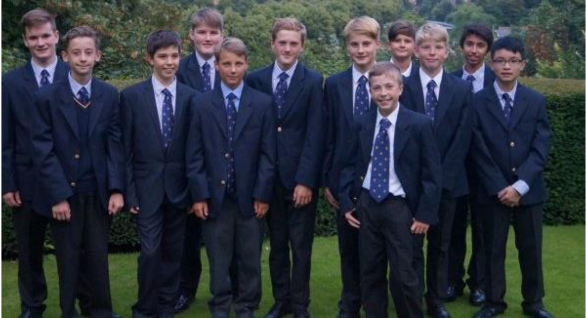
Our new Third Form Ridgemountaineers on the eve of their first full day at Shrewsbury