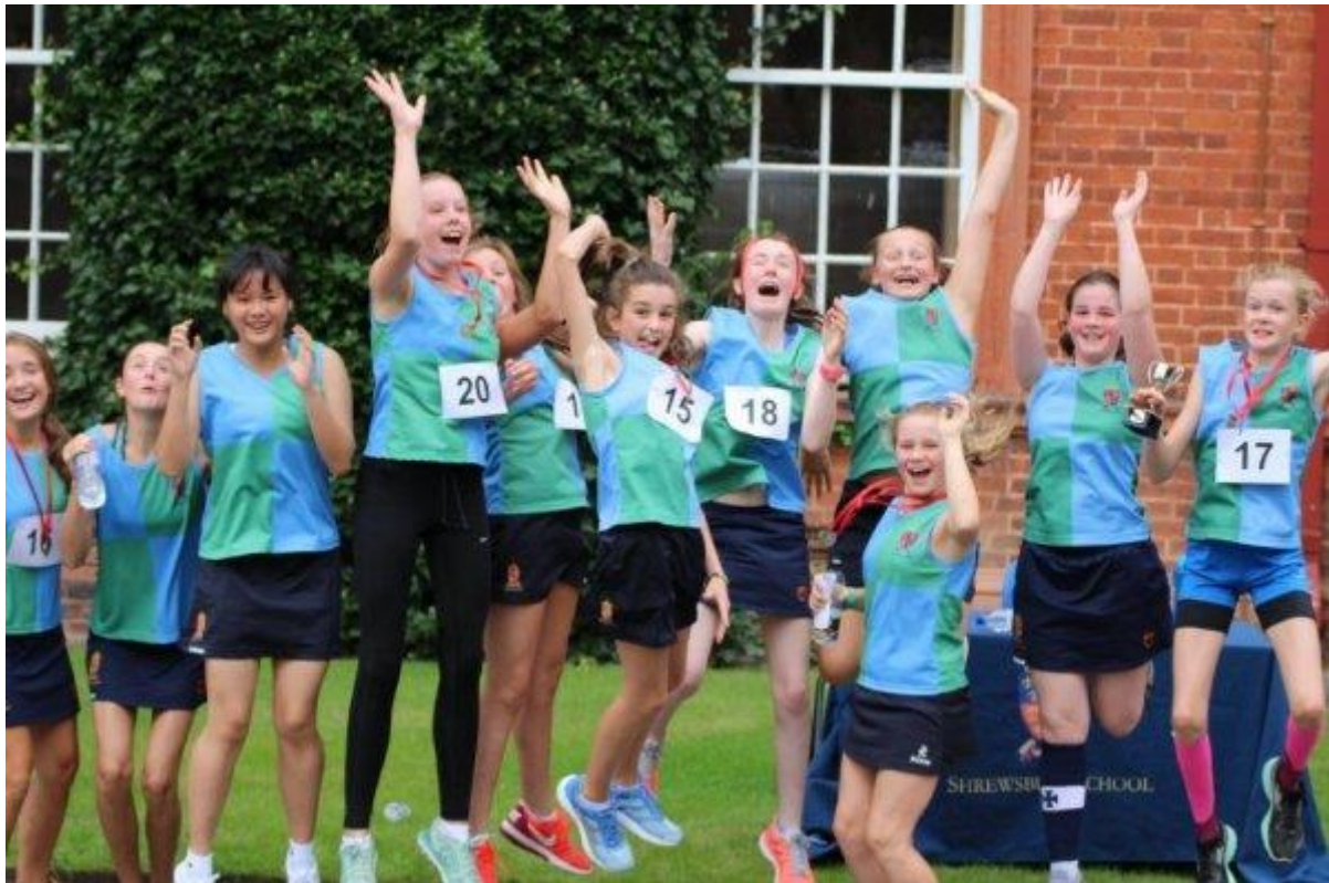
Emma Darwin Hall team