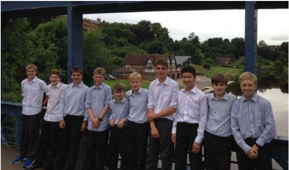
Quick trip into town between lessons and sports