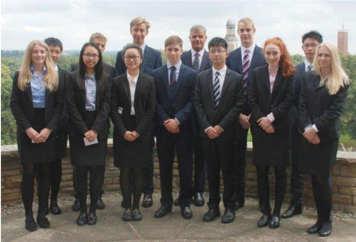
The Headmaster with the Honorary Scholars and Honorary Exhibitioners

Following the GCSE exams, 40 pupils have been awarded Honorary Scholarships, Exhibitions and Examination Prizes for achieving outstanding scores.