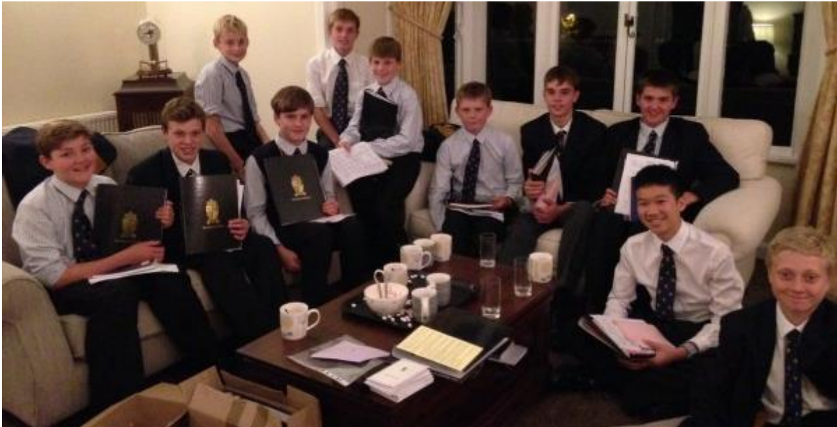
Ready for Day 1 - and looking sharp!