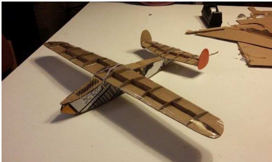
The group's model glider