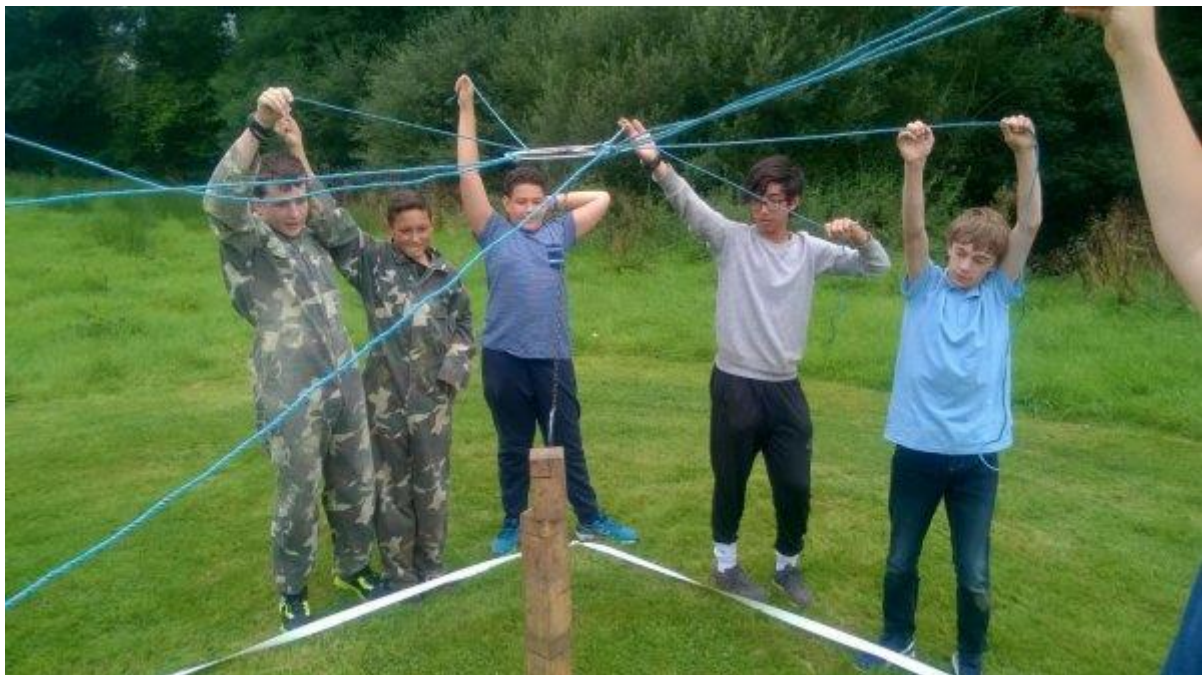
A task successfully completed – excellent teamwork!