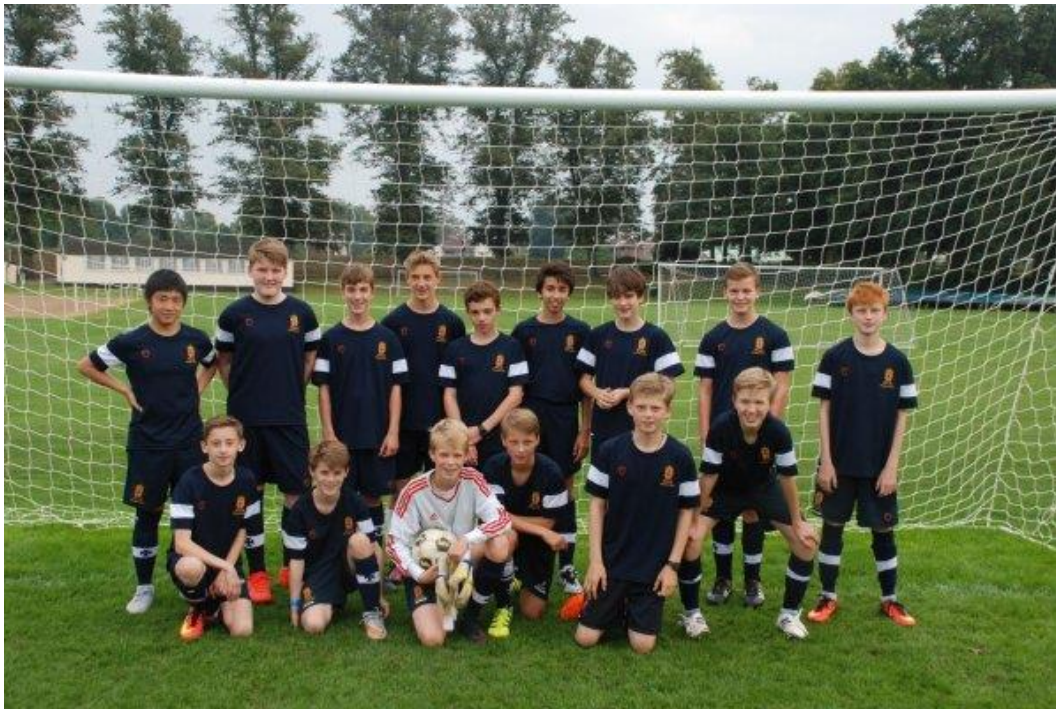
The U14Cs back in confident mood