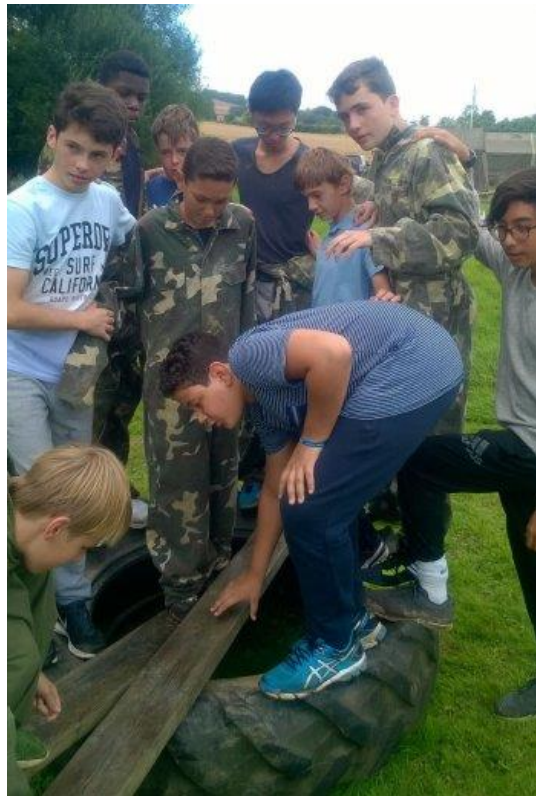
How many School House boys does it take to build a bridge between two tyres?