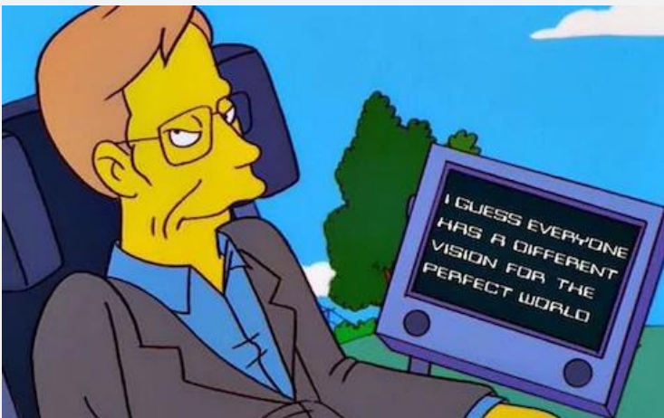
As well as his scientific notoriety, Hawking rose to fame as a regular, recurrent character on The Simpsons and Family Guy. Interestingly, he believed that by demonstrating his ability to caricature and make light aspects of his illness, he was able to make it more bearable and demonstrate to other sufferers that it was possible to lead a fulfilled and extraordinary life. Click here for more.

Despite the serious setbacks he experienced in his own life, Hawking never lost his keen sense of humour and an ability to perceive humanity as something special, emotional and unique – something for which he will be long remembered.