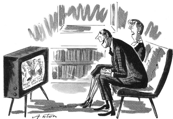
"Stop laughing, you fool - they're taking the mickey out of people like us."