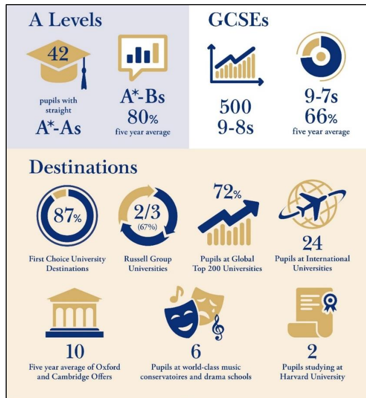
2024 Public Examination Results at Shrewsbury

In recent years, around 10% of our leavers have gone on to Oxford and Cambridge and virtually all have won places at the university of their first choice. We expect about 80% of A Levels each year to be passed at A*, A or B grade. But there is as much joy for pupils who surpass his or her expectations as there is for the pupil whose progress to top grades always seemed more certain.