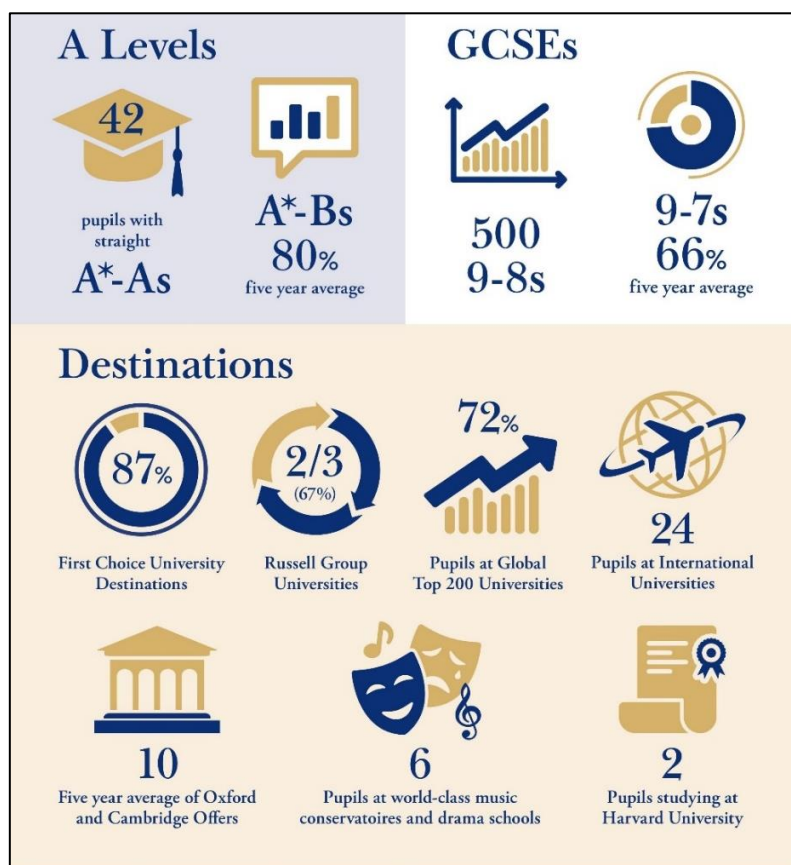
2024 Public Examination Results at Shrewsbury

In recent years, around 10% of our leavers have gone on to Oxford and Cambridge and virtually all have won places at the university of their first choice. We expect about 80% of A Levels each year to be passed at A*, A or B grade. But there is as much joy for pupils who surpass his or her expectations as there is for the pupil whose progress to top grades always seemed more certain.