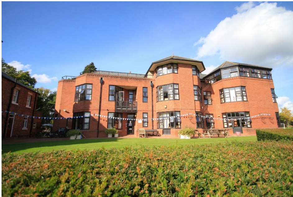
The Grove Boarding House

The House is a Salopian's centre of gravity, a real home from home, somewhere to relax and make friends, as well as work. In addition to their Housemistress or Housemistress, each pupil has a personal tutor who also has strong links to a house and will be involved in a duty evening plus helping out with house events and trips.