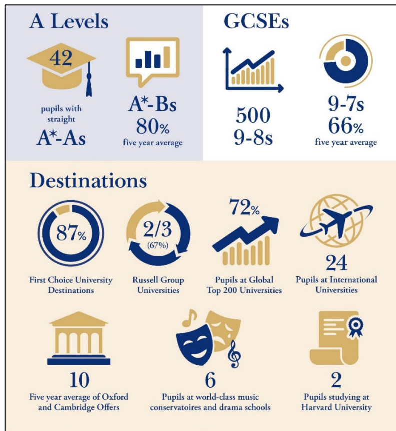
2024 Public Examination Results at Shrewsbury

In recent years, around 10% of our leavers have gone on to Oxford and Cambridge and virtually all have won places at the university of their first choice. We expect about 80% of A Levels each year to be passed at A*, A or B grade. But there is as much joy for pupils who surpass his or her expectations as there is for the pupil whose progress to top grades always seemed more certain.