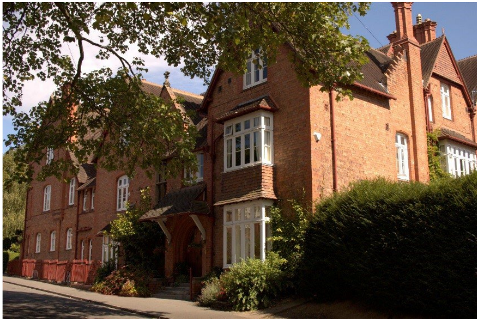
Moser's Boarding House

The House is a Salopian's centre of gravity, a real home from home, somewhere to relax and make friends, as well as work. In addition to their Housemistress or Housemistress, each pupil has a personal tutor who also has strong links to a house and will be involved in a duty evening plus helping out with house events and trips.