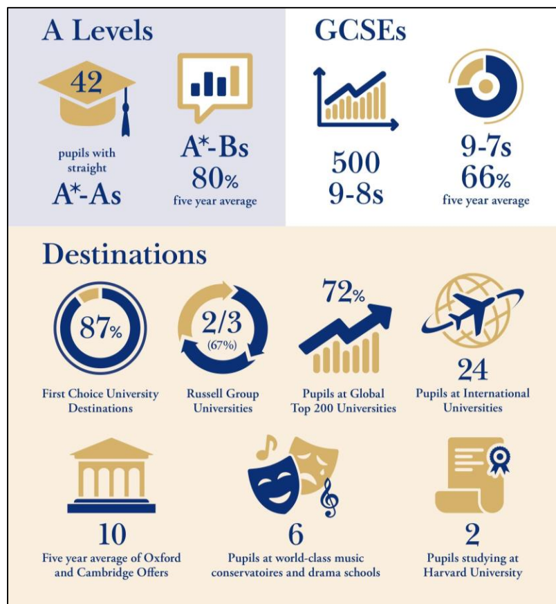
2024 Public Examination Results at Shrewsbury

In recent years, around 10% of our leavers have gone on to Oxford and Cambridge and virtually all have won places at the university of their first choice. We expect about 80% of A Levels each year to be passed at A*, A or B grade. But there is as much joy for pupils who surpass his or her expectations as there is for the pupil whose progress to top grades always seemed more certain.