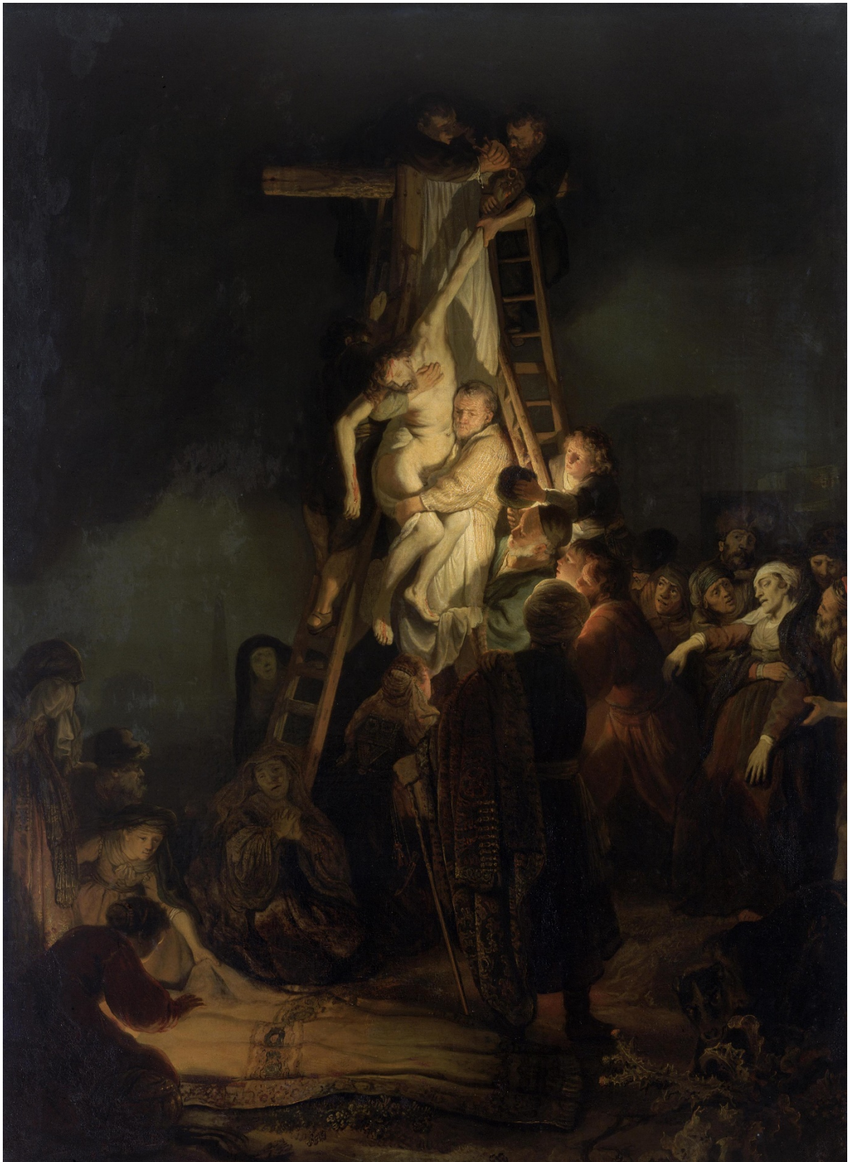
Figure 4: The Descent from the Cross , Rembrandt, 1634, Oil on Canvas, 158 x 117 cm