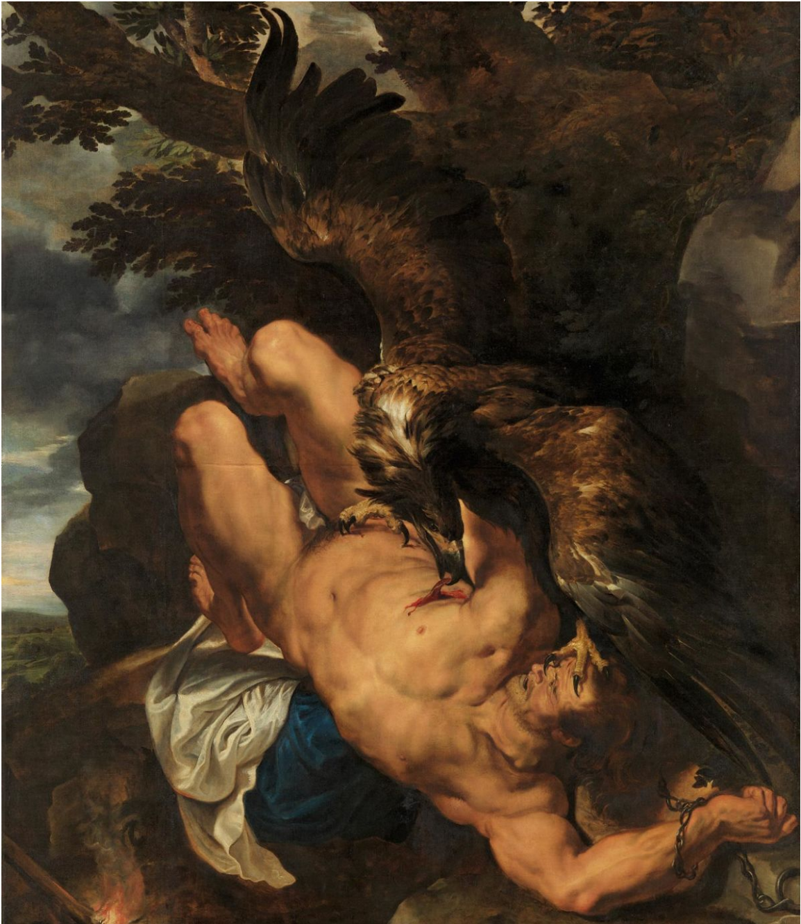
Figure 1: Prometheus Bound , Rubens, 1612, Oil on Canvas, 2.4 x 2 m