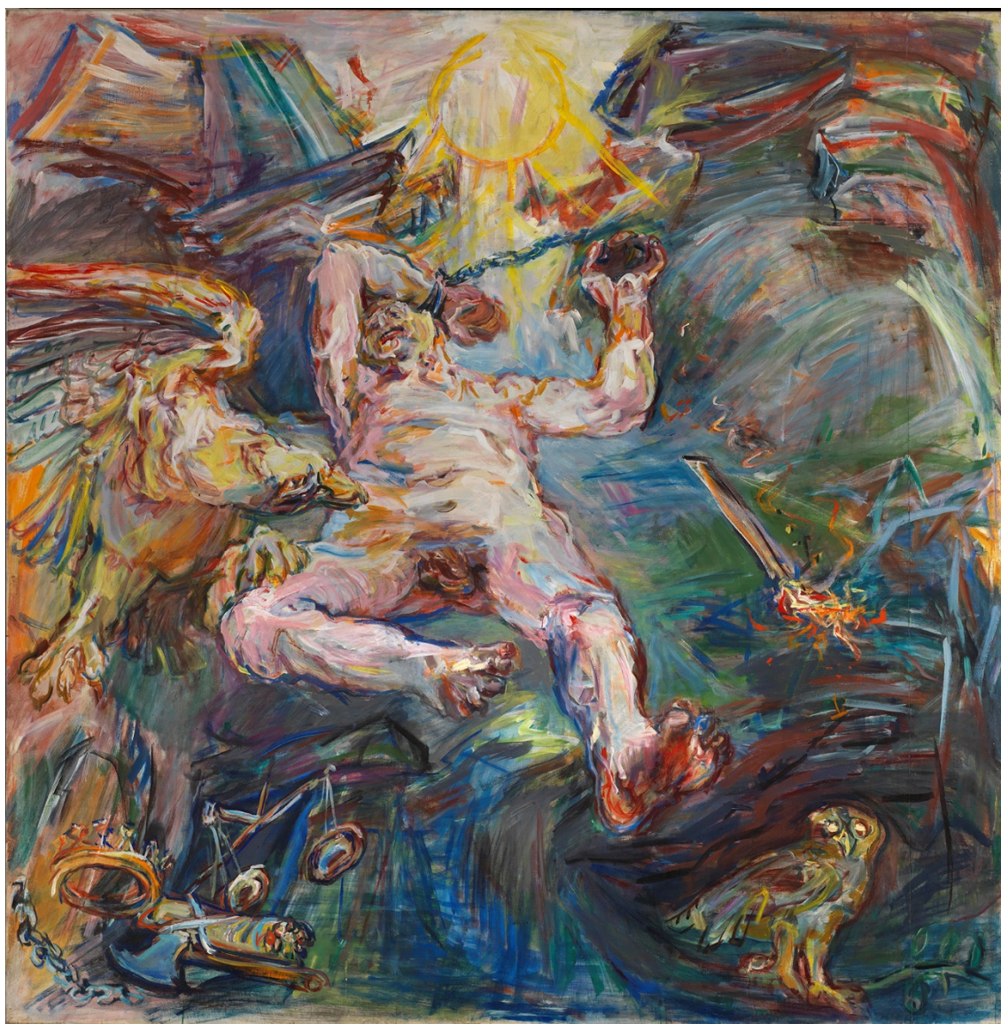
Figure 2: The Myth of Prometheus , Oscar Kokoschka, 1950, Oil on Canvas, 2.4 x 2.3 m