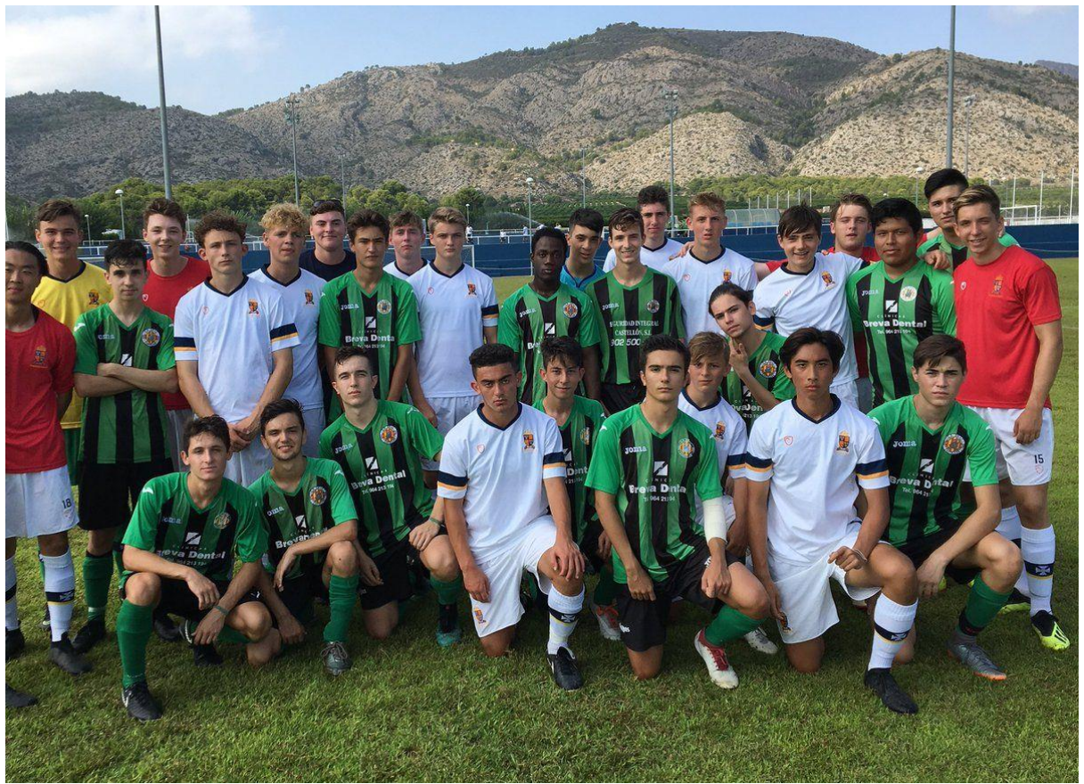
The group also experienced a stadium tour of the Mestalla, home to Valencia CF, and a La Liga game between Levante and Celta Vigo.