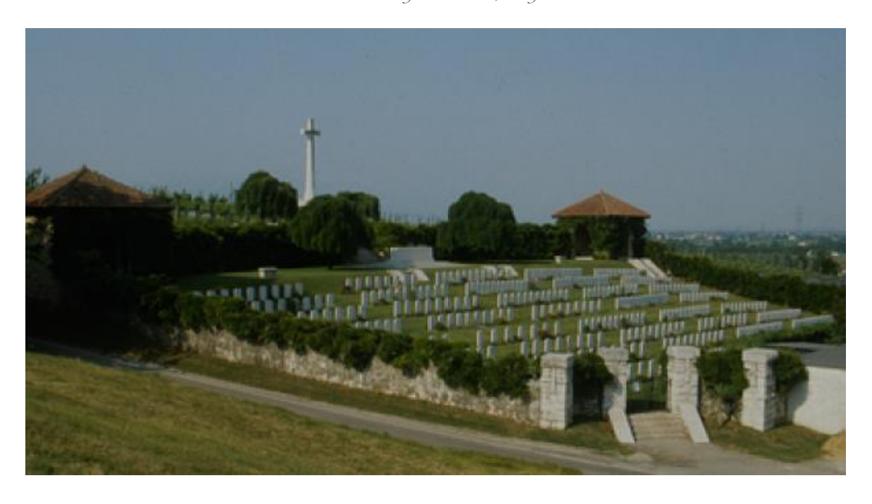
Montecchio Precalcino Communal Cemetery Extension

Buried at Montecchio Precalcino Communal Cemetery Extension, Italy. Plot 5. Row C. Grave 8.