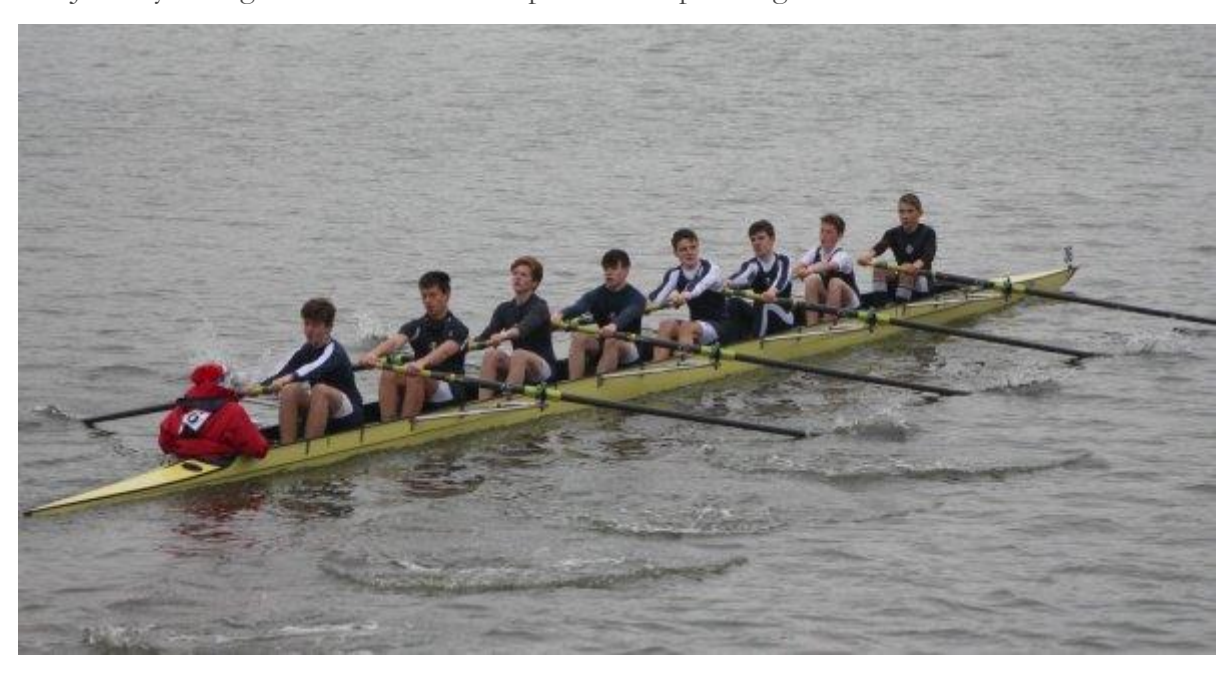
Winning Novice eight

The J14 boys and girls both won their respective octuple categories.