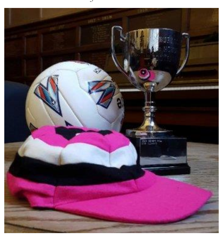
2nd House Trophy

The boys of School House have had a fantastic run in all football competitions this term, winning the great majority of their matches across all ages in the three different leagues. This form continued into the cup competitions at the end of term with victory in the 2nd House Cup, runners-up in 1st House and semi-finalists in U15 House.