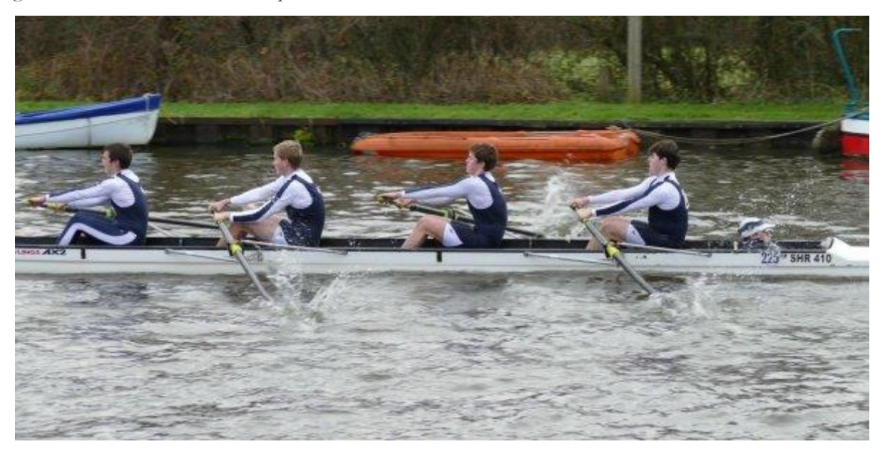
J16 coxed four

The J16 boys recorded wins in the J18 coxed fours, J16 coxed fours and novice quad. The J16 girls were third in the novice quad.