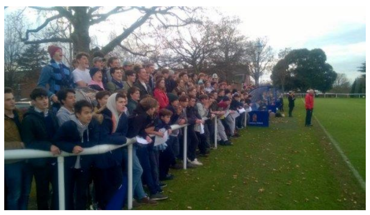
Supporters were out in force and in fine voice for the final.