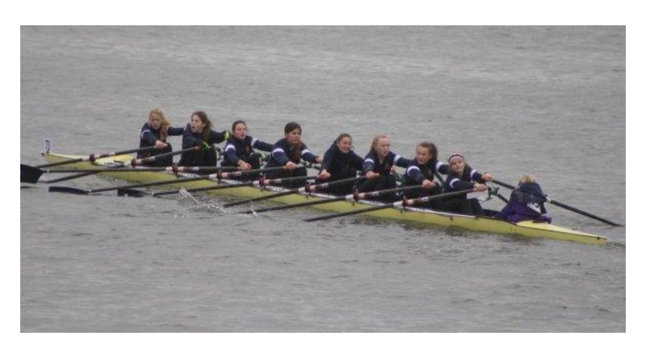
Winning WJ14 octuple