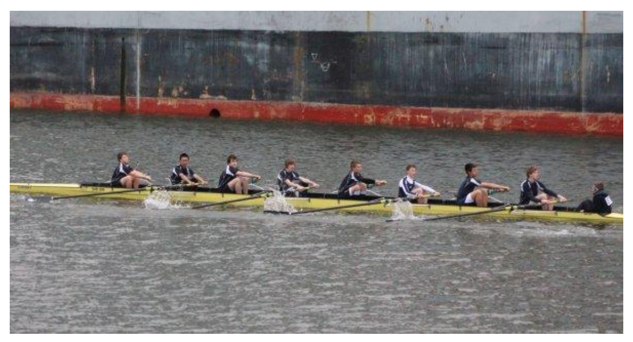
Winning J16 eight