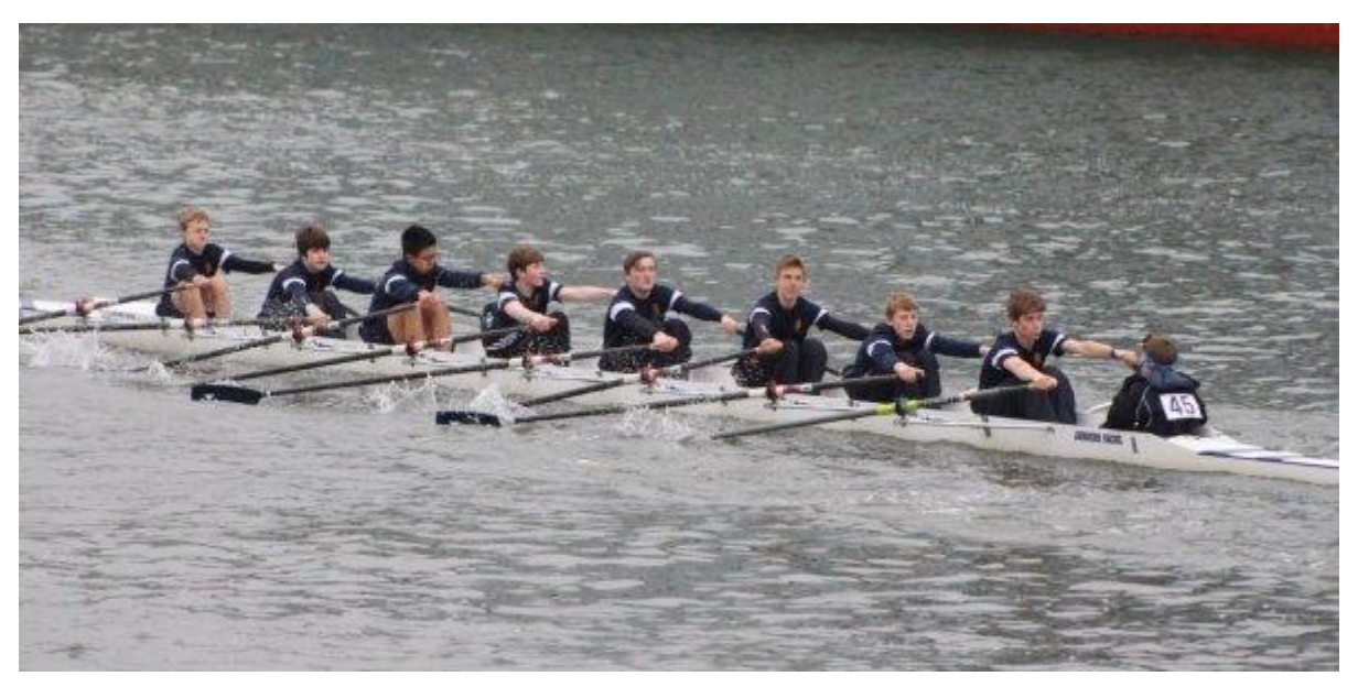
Winning J14 octuple