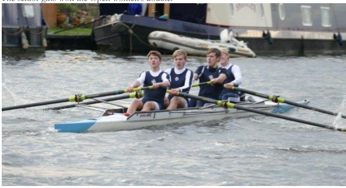
J18 coxed four

The senior girls won the Open women's double.