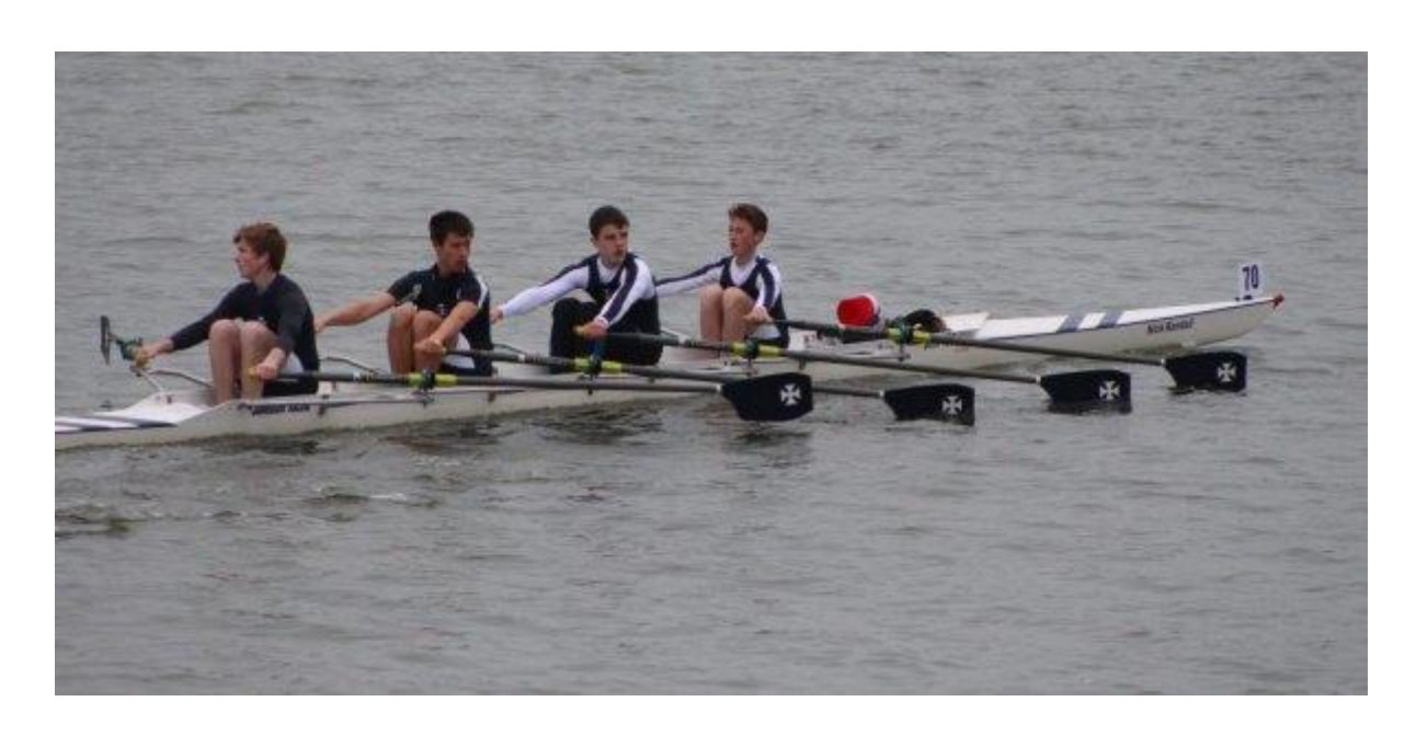
Winning J15 coxed quad