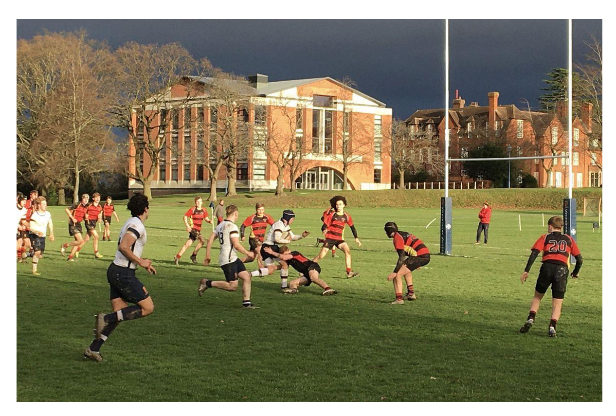
The 1st XV playing under a glowering sky...

The rugby season got underway in fine style on Saturday 11th January with a block fixture against Birkenhead School.