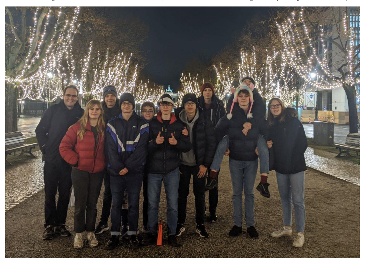
By the next evening, our whirlwind trip had ended and we were all back with our families ready to enjoy Christmas

As a treat for our last night we revisited Potsdamer Platz to go sledging and then visit yet another Christmas market at the Gendarmenmarkt. For our final supper we went to the Sony Centre - which is covered in bright LED lights and is where German films are premiered - before having traditional German cuisine. (No-one was brave enough to try the pork knuckle.)