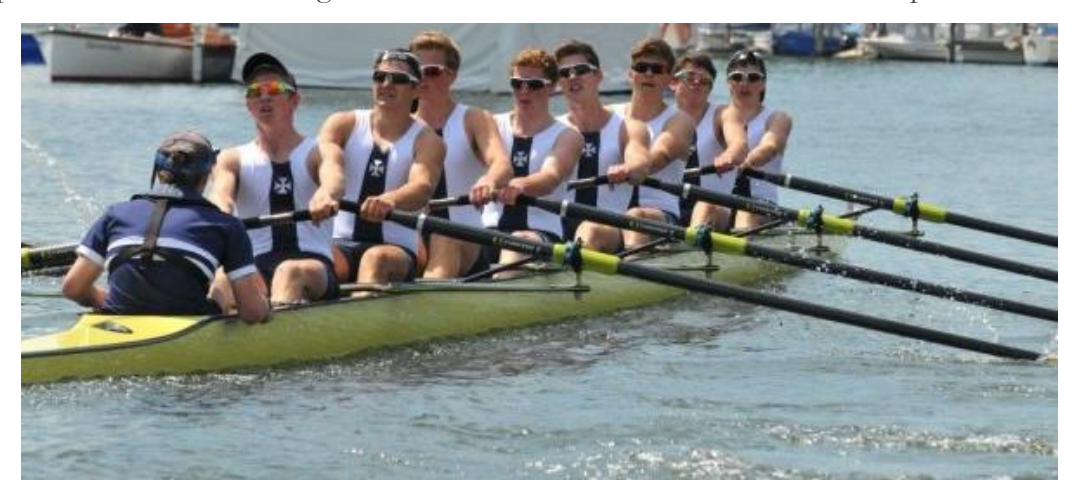
1st VIII in action against Bedford Modern School

themselves in the lead and develop a strong rhythm to control the race through to the finish and set up a second round match against National School's bronze medallists Hampton.