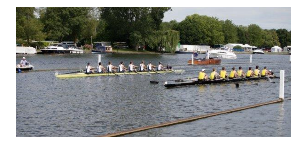
Final stages of the race vs Hampton