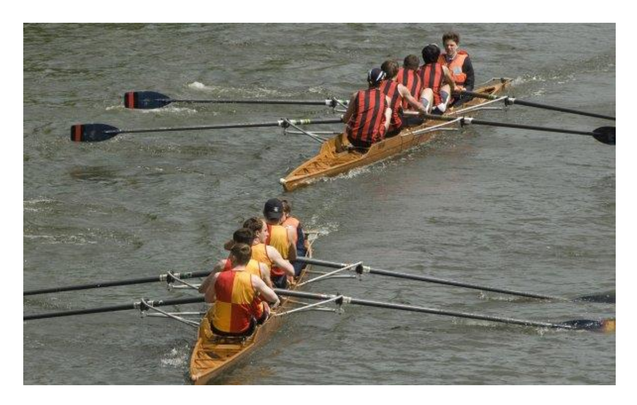
Bumps 2 closing in on Port Hill for the bump