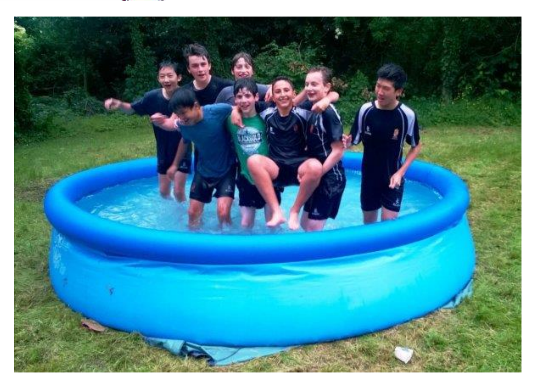
The traditional cool-off after the Bumps BBQ in the School House garden