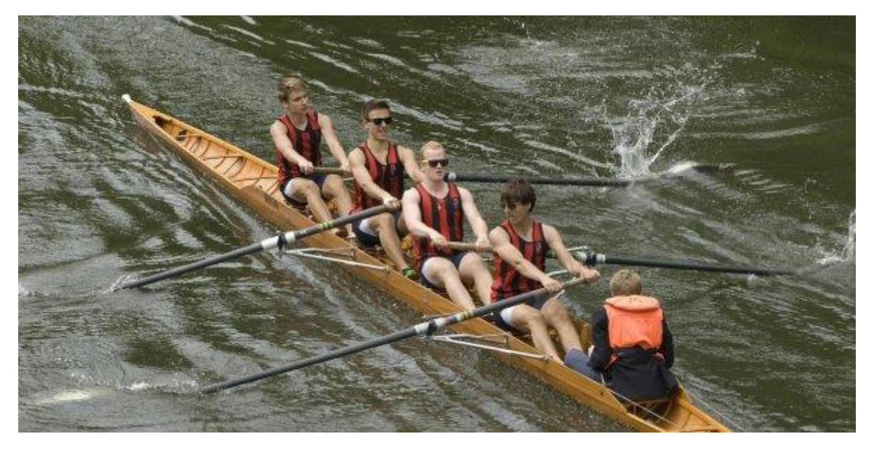
Moser's Hall Bumps 1 crew set off hard in pursuit of Rigg's