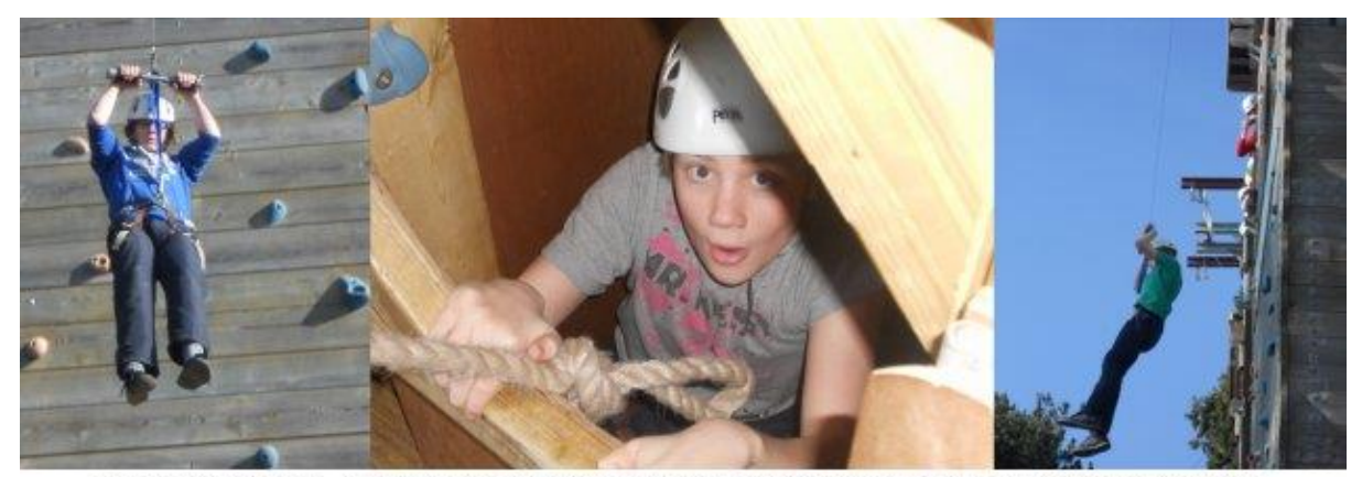
Adventure Tunnelling - through the tubes and up to the top of the tower followed by stepping off the top on the Parachute Simulator