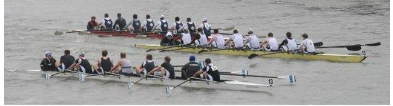
Ist 8 overtaking Cygnet Boat Club and Bristol Ariel Boat Club on their way to victory in IM2 eights

This is the first time that we have competed in the Hammersmith Head for some years, and we were delighted to have taken first place in the IM2 eights.