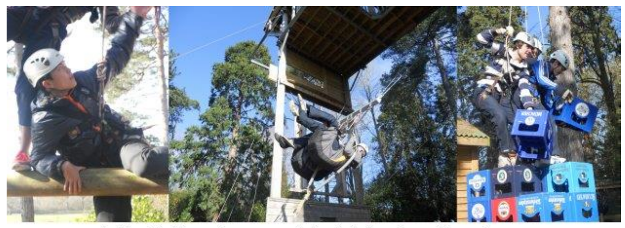
Left: Jacobs Ladder - work as a team to climb up the ladder without pulling on the ropes Middle: Giant swing Right: Crate Stack Challenge - standing on top of a very wobbly tower which they built whilst balanced on it - another team effort!