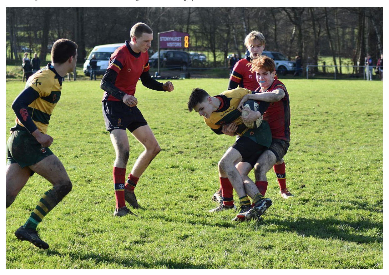
Facing a Cheadle Hulme side that they had beaten 26-10 in the group stages, they knew that they had the skills to win the match; it was just a case of trying to stave of the tired legs long enough to win!

The team breezed past Rossall School in the quarter-finals (47-0), before defeating Birkenhead 26-7 in the semi-final. By the last match of the day the team were carrying knocks and bruises, and exhaustion was running high. But only 15 minutes stood between the team and silverware, and they were determined not to go home empty handed!