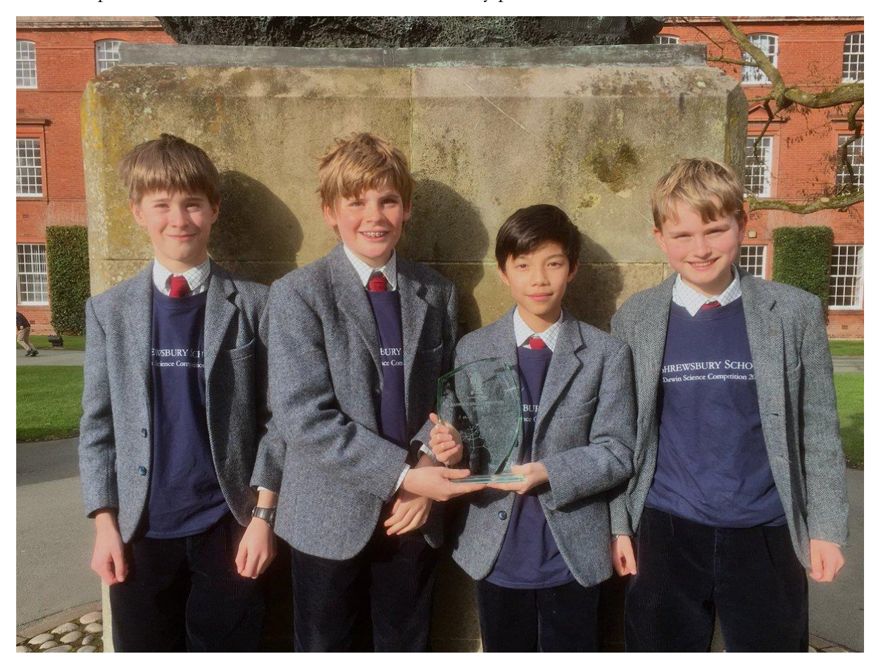
Darwin Science Competition 2019 winners - Cothill 1

Each 1st place team was awarded a fun science activity prize for their efforts.