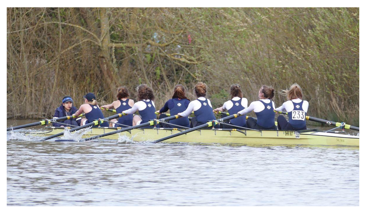
Senior Girls' VIII