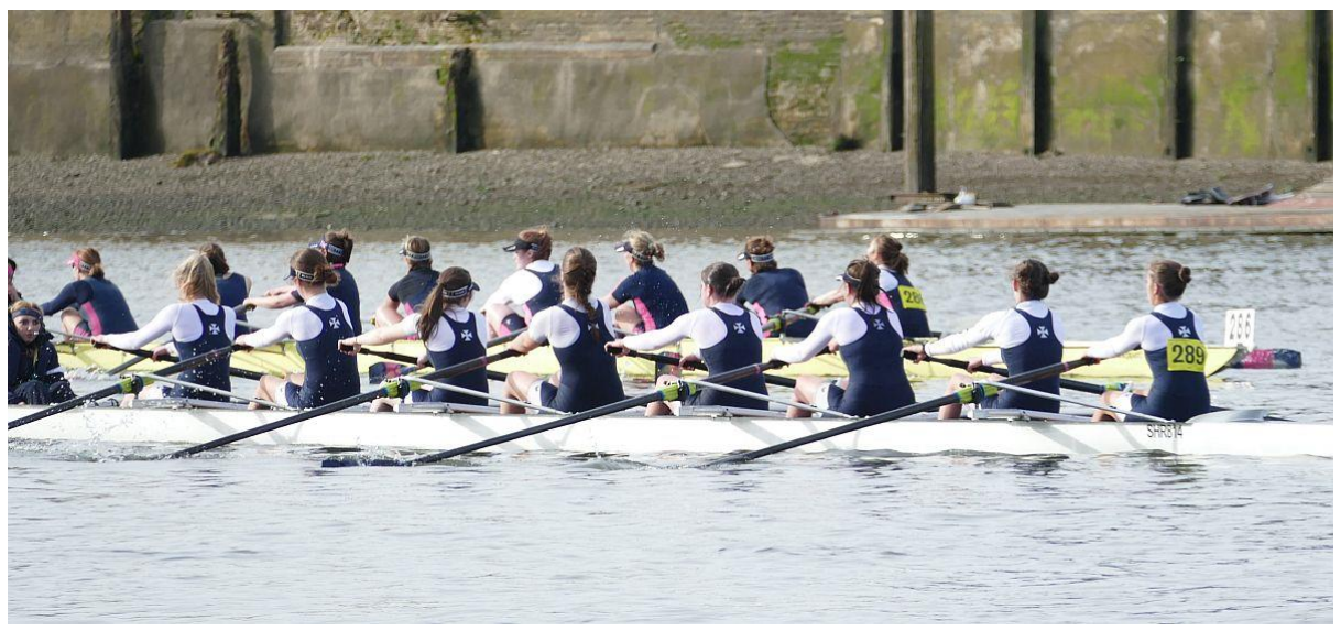
The winning G1st VIII at Hammersmith Head

RSSBC crews competed at three different venues last weekend, in the Hammersmith Head, the West Midlands Junior Championships and home time-trials against King's Chester - all valuable preparation for the Schools' Head and Scullery Head next week.