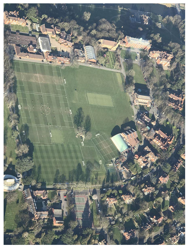
With a few more days like this planned for the rest of the year, the entire Section should get the chance to experience this for themselves.