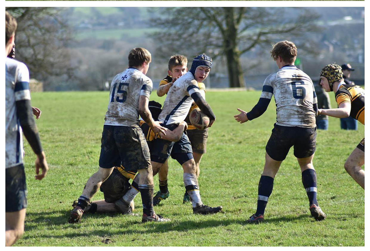
The 1st team found themselves in a pool of death, with three sides tied for the top spot after one loss each in their pool of five: Lancaster Grammar, King's Macclesfield and Shrewsbury. On conversion count-back they found ourselves in the Plate competition, and set out on the task to win it.