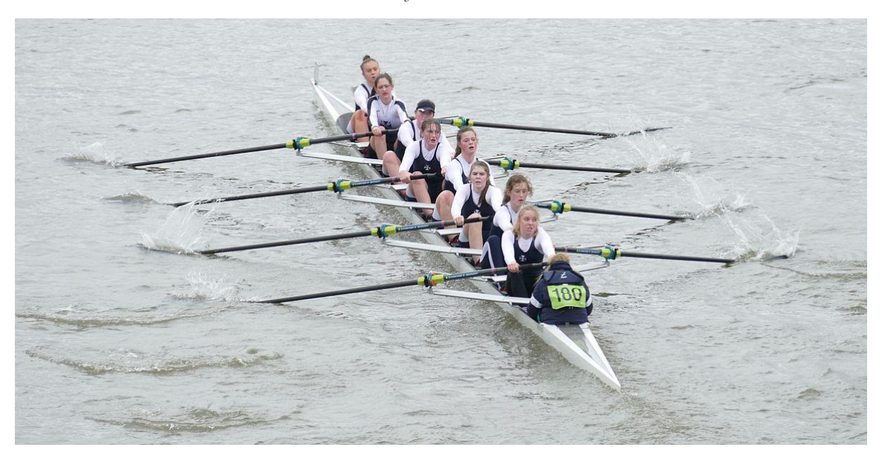
Senior Girls' VIII