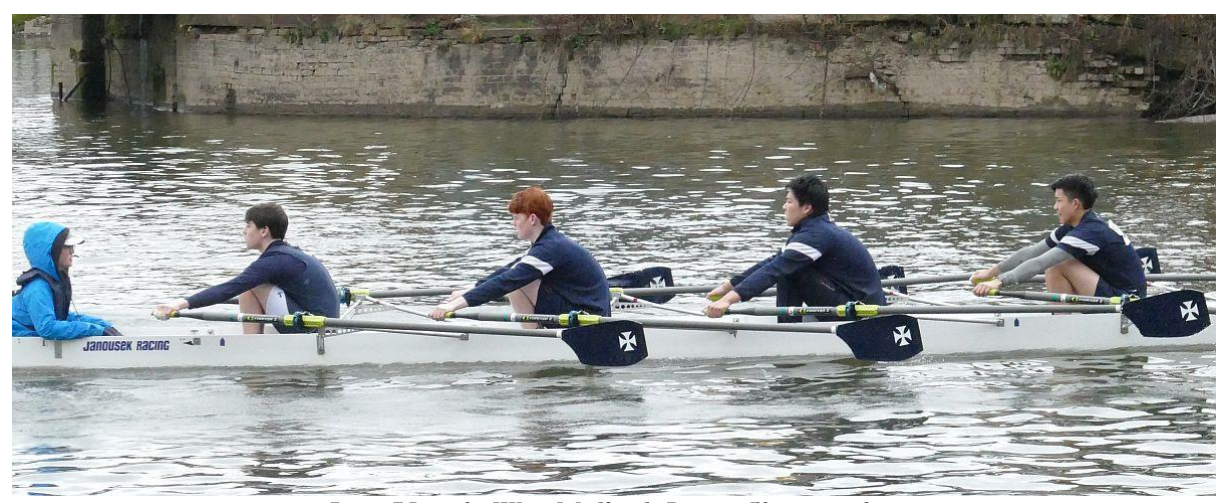
[15 4X at the West Midlands Junior Championships

We also saw fantastic performances from the Shrewsbury boys' B eight and the girls' octuple.