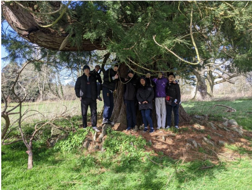
The group were awe-struck by the ancient trees at Croft Castle. They are pictured below standing next to a 1,000-year-old quarry oak.