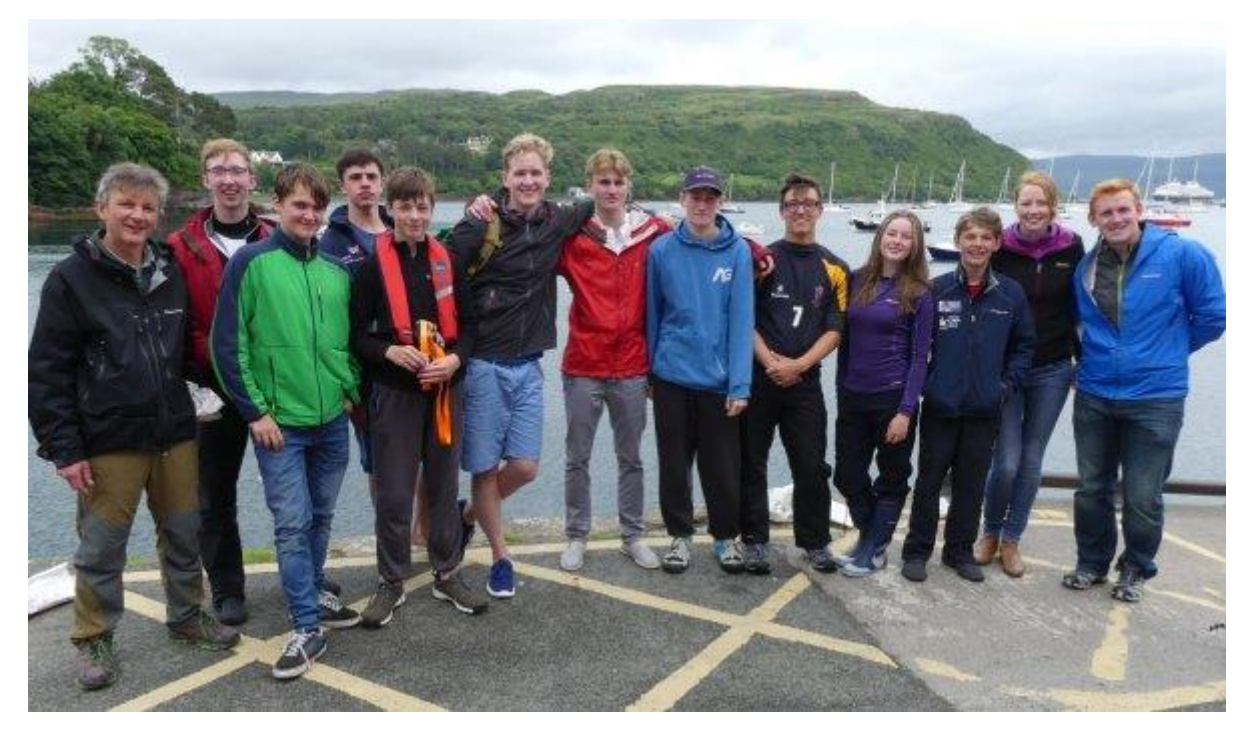
This expedition is the first of many run by the Rovers. Please see below for the launch of this year's expeditions, which are open to all pupils at the School: