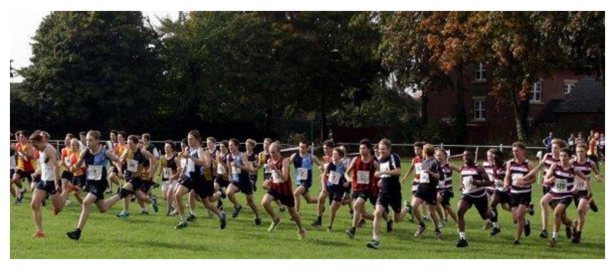
The 1st Wave sprint up the hill at the start of the Tucks, before jostling for position over the 5km course